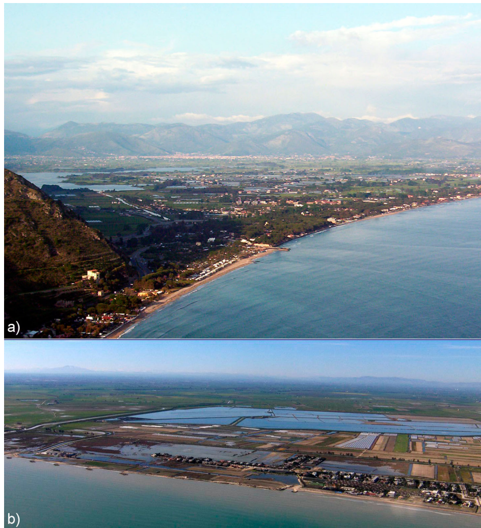
Figure 1. The Italian coastal areas are characterized by important human settlements that are sensitive to sea level rise: (a) the Fondi Plain, near Latina (Latium, Italy) is one of the 33 areas of the Italian coastal zones prone to marine flooding (Lambeck et al., 2011); (b) the Mouth of Carapelle river, near Foggia (Apulia, Italy) with damaged wetlands after the sea-storms occurred on February/March 2009.

according to Church et al. (2013) and Rahmstorf (2007) projections and include the rates of glacio-hydro-isostasy estimated by Lambeck et al. (2011). Our goal is to provide detailed maps (M1, M2, M3, and M4) of potential marine flooding scenarios at four densely urbanized and populated Italian coastal areas for the year 2100. The areas include the northern Adriatic and the coastal plains of Oristano, Cagliari, and Taranto (Figure 3).