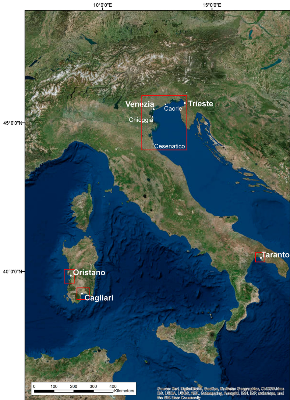
Figure 3. The four Italian areas investigated in this study, characterized by coastal plains and geo-diversity.

ISPRA network, 2000–2013 series) (Antonioli et al., 2017). Even though, the more recent values are not representative for the long-term trends due to sea level variability, both the tidal data and the cGPS data confirm a trend of land subsidence, in agreement with the geological data shown in Antonioli et al., 2017.