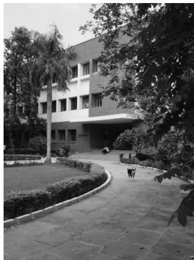
Delhi School of Economics, India

At the DSE, students’ interactions with teachers, academicians, and peers from various fields of study exposes them to different perspectives, ideas, and cultures helping them gain a deeper insight into matters concerning the world. The programs of DSE focus on various aspects – in addition to acquiring fundamental core economic knowledge, its programs are designed to incorporate content that is more vocation oriented, such as developing teamwork, and there is a continuous initiative toward skill upgradation, stress management, and cross–cultural exposure (Bottom line 2015, Delhi School of Economics).