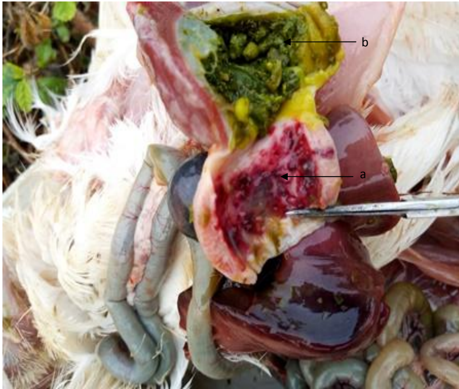
Plate 2. Haemorrhage seen in the proventriculus (a) and green coloured content in the gizzard (b)