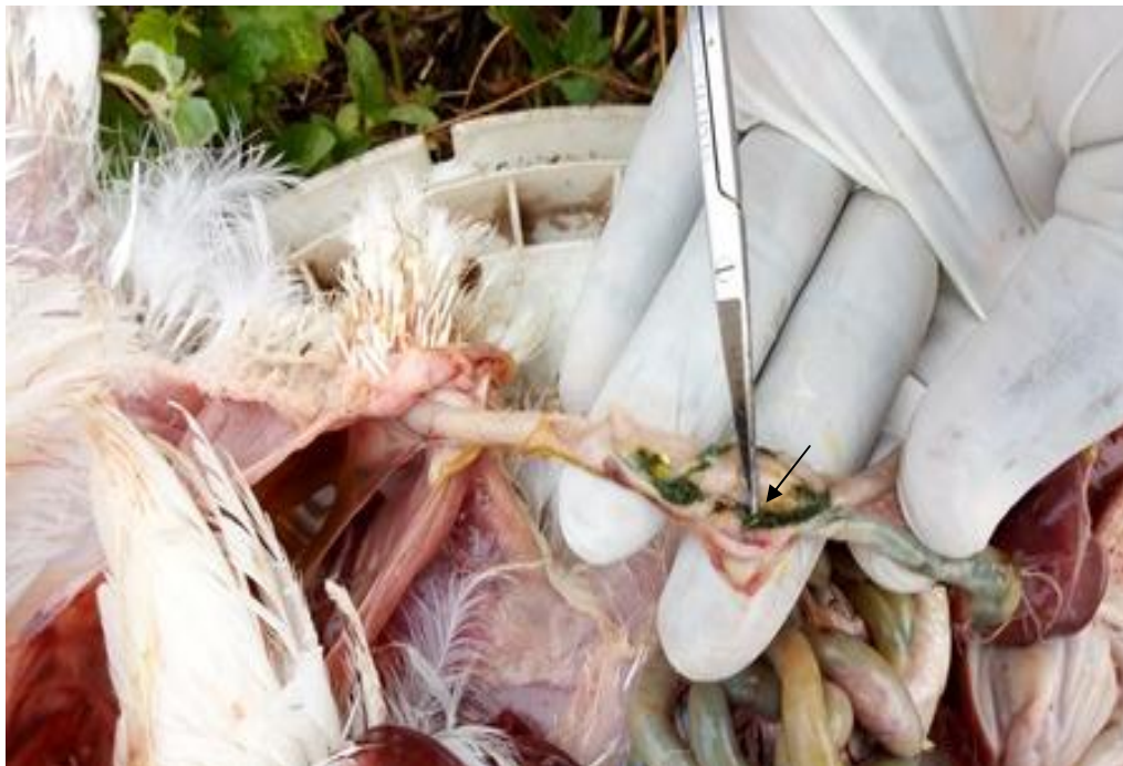
Plate 3. Haemorrhage in caecal-tonsils (marked by arrow)