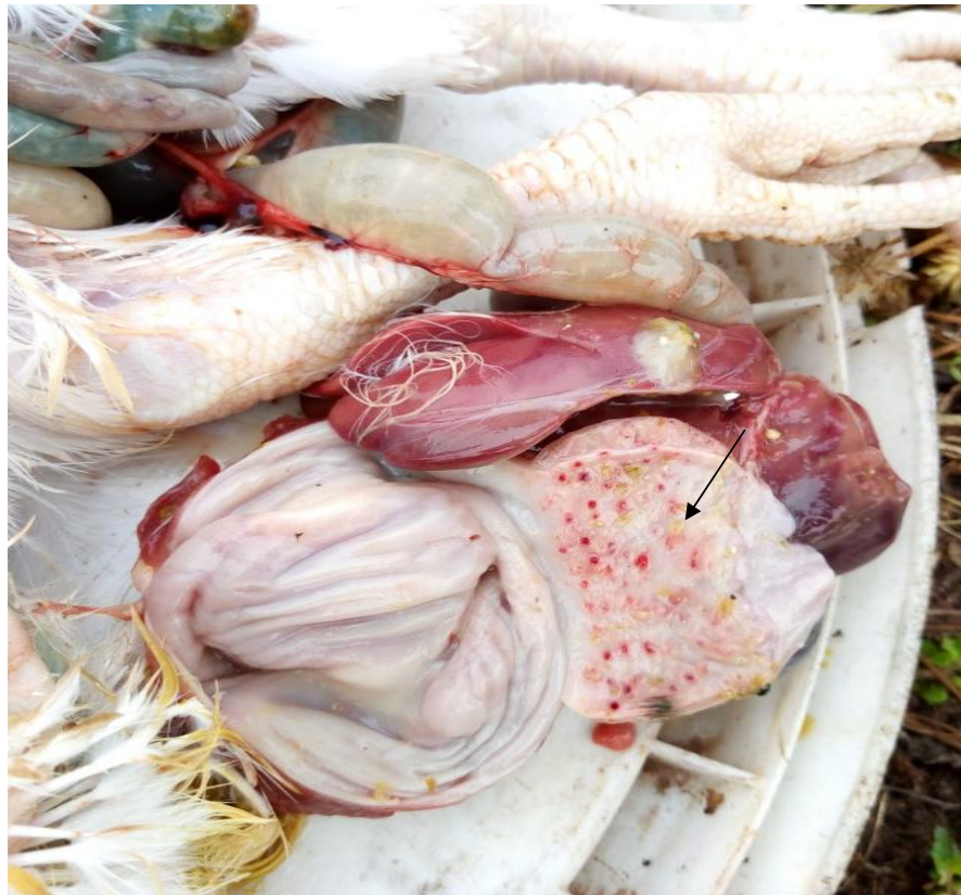
Plate 1. Petechial haemorrhage in the proventriculus (marked by arrow)

These compounds exert their virucidal effect by interfering with viral multiplication [17]. Specifically, some of these compounds are speculated to exhibit protease inhibition, hence interferes with cleavage of haemagglutinin neuramidase and fusion protein, which are important glycoproteins for ND virus attachment and multiplication [18]. Other classes of compounds such as flavonoids from plant extract have been reported to act by inhibiting production of prostaglandin (signaling molecule) and phosphodiesterases involved in cell activation [13].