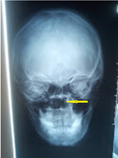
Figure 2. Left intranasal mass.