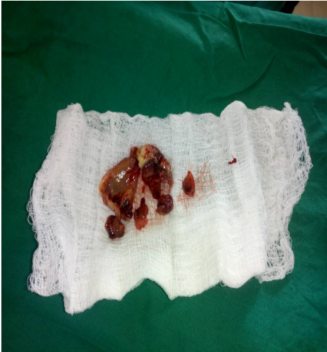
Figure 4. Gross appearance of the tumor. Reddish, fleshy, firm and well-encapsulated mass.