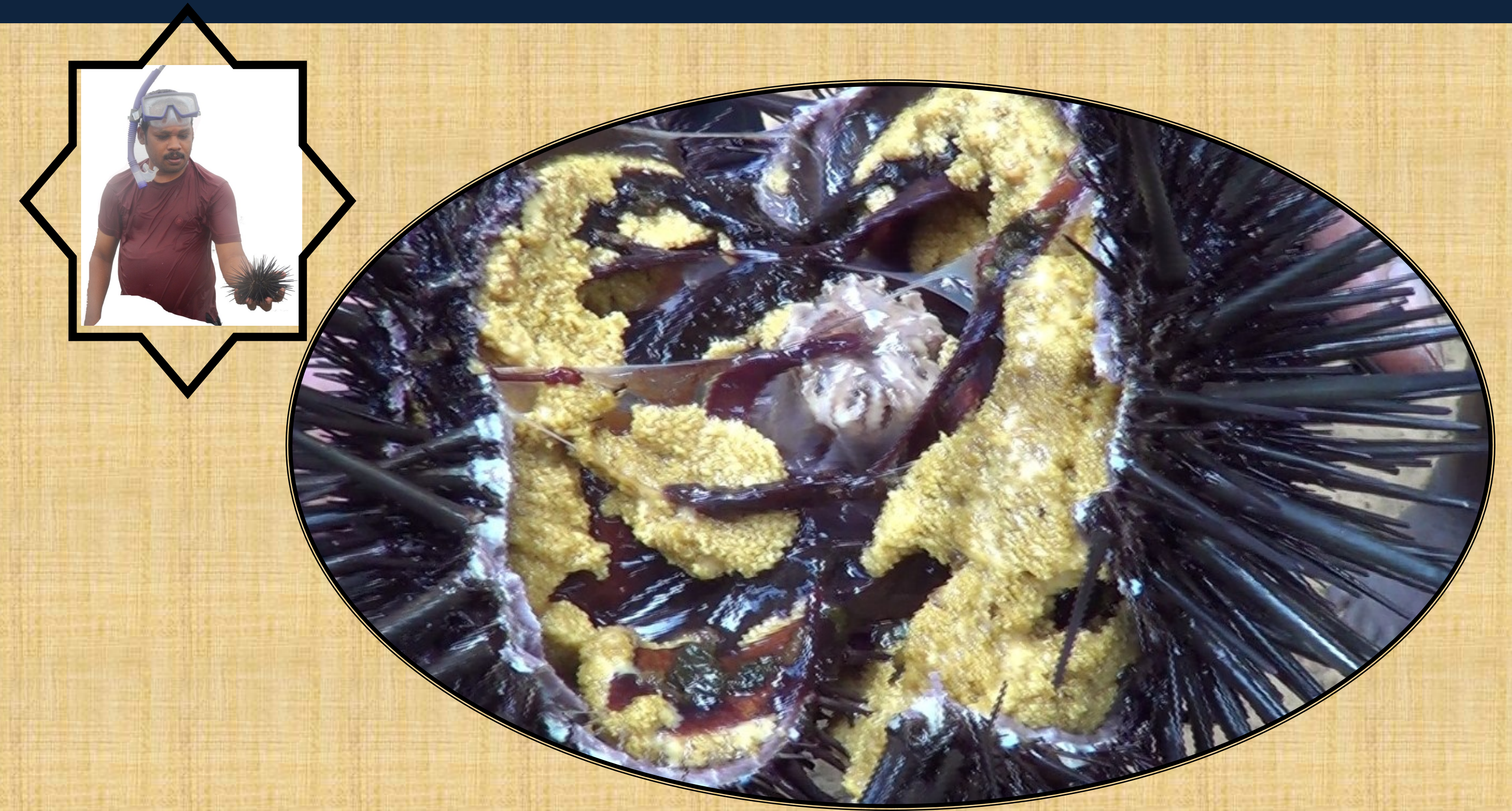
Figure.1 Gonads of sea urchin S. variolaris

Sea urchins can not synthesize carotenoids de novo and obtain from the natural diets in the wild. In the present study gonads of S.variolaris did not contain two ketocarotenoid pigments viz. , Astaxanthin and Canthaxanthin; but however there were other eight pigment peaks observed. This study gives an idea of the quantifiable carotenoid naturally available in the gonads of sea urchin S.variolaris , which is consumed by the fishermen population of Gulf of Mannar, Kannyakumari and Karwar. This work provide the baseline information on the carotenoid pigments, which is responsible for the colour of the gonad, an attribute very much important in deciding its quality for consumption. The edible sea urchin of different species are in culture in many countries around the world. This work gives scope to future work in assessing the various carotenoid pigments available in Indian sea urchin species along the vast coastal waters of India, which is a first step towards the long term goal of developing a candidate species of sea urchin for echiniculture activities.