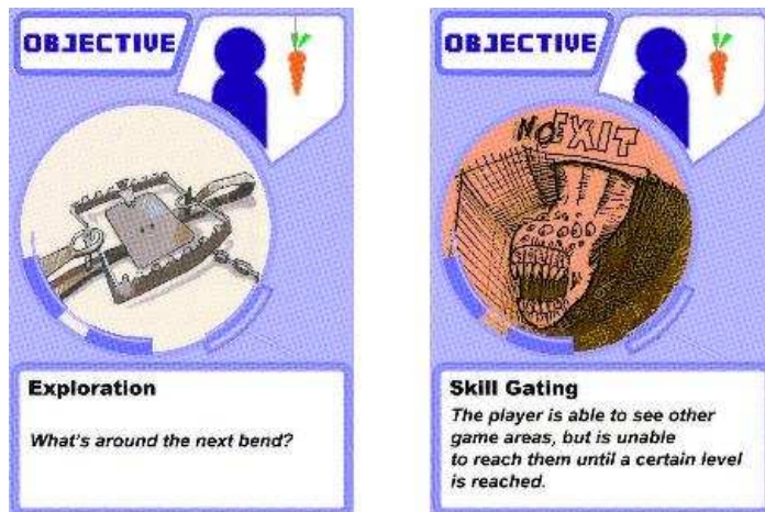
Figure 2. Example Game Mechanic cards