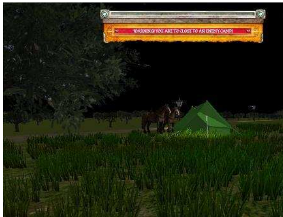
Figure 5. Enemy camp notification.

Game objectives were delivered by a number quest givers (fig 4), who also introduce a storyline element, as well the initial exploration objective of finding the next quest giver within the woods surrounding the player. The player has no specific boundaries, and is allowed free access/roaming across the majority of the map, other than areas where they are corralled or blocked by raised ground at the edges of the playable area. This safe environment promotes exploration, the only real challenge in the game being slaver camps (fig.5), which, if approached, display an on-screen warning to move out of view. The player is guided, or signposted in the correct direction by gas lamps (fig.6), and upon reaching the second quest giver, is directed toward a side mission, collecting pages of a diary scattered through the woods. The second quest giver also warns about following the road, promoting the subterfuge mechanic. Finally, pattern recognition is noted – learning the placement of the enemy camps is an important aspect of progressing.