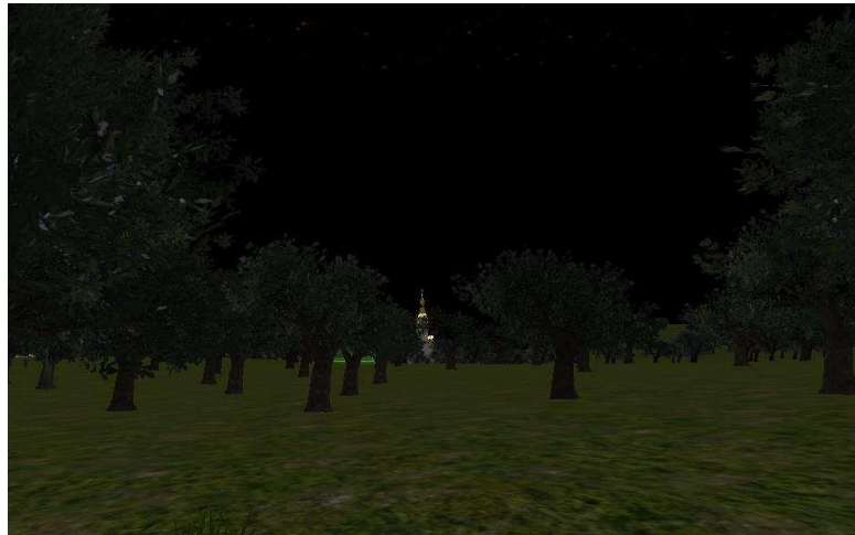
Figure 8. The distant church

As described in (fig. 7) Exploration was found to be the most prominent mechanic, with eight out of the nine participants mapping it against the remembering category of Blooms. In the context of the information provided by the quest givers i.e. 'go to point A, B, etc.' exploration seems closely tied to the remembering aspect of Bloom's taxonomy. It is noted that a number of participants headed for the visible spire of a distant church. On arrival, a quest giver informs them 'there is nothing here, please go away!' (Bloemhoff, 2013). Or as a player noted; 'Exploration is not rewarded, even though it is encouraged by points in the distance (the church)' (fig.8).