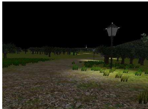
Figure 6. Signposting