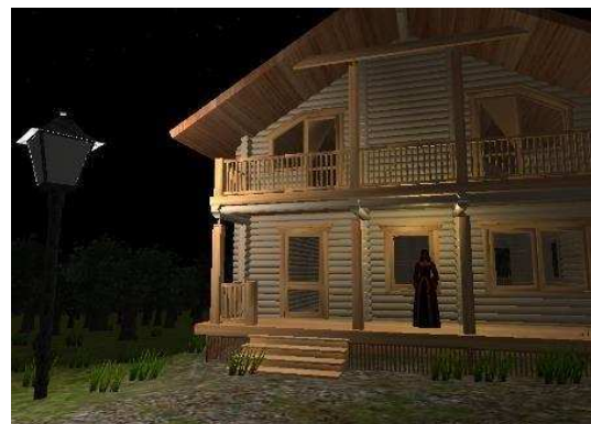
Figure 4. The first quest giver .