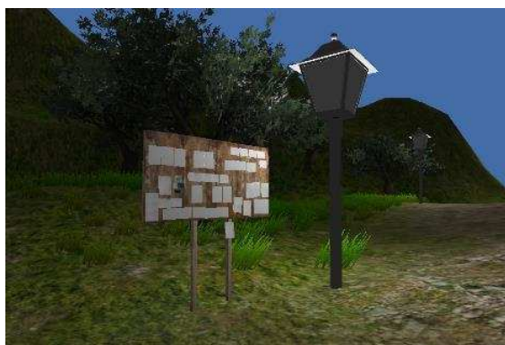
Figure 3. The noticeboard at the start of the game.

A description of the case specific game mechanisms within the context of the case study follows. These are presented as per the order of introduction within the game and shown in italics. The same mechanics are also specified within Table 1. The Primary game objective was to find the underground railway, and escape the area, as introduced via a notice board beside the player start position (fig. 3) other information, such as a map of Maryland was embedded within the loading screen, outlining the events and objectives in a historical context;