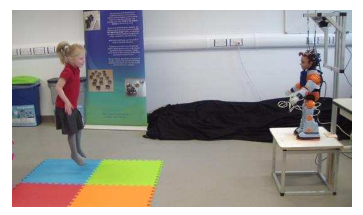
Figure 2. A child playing Simon Says with Zeno

Zeno gave one of three simple action instructions: "Wave your hands", "Put your hands up" or "Jump up and down". Each instruction was given either with the prefix of "Simon says" or no prefix; instructions were delivered in pseudorandom order. Zeno gave relevant actions to accompany each instruction (e.g., waving its arms with the "Wave your hands" instruction). Each instruction delivered was accompanied with Zeno moving its mouth to correspond to the synthesised speech.