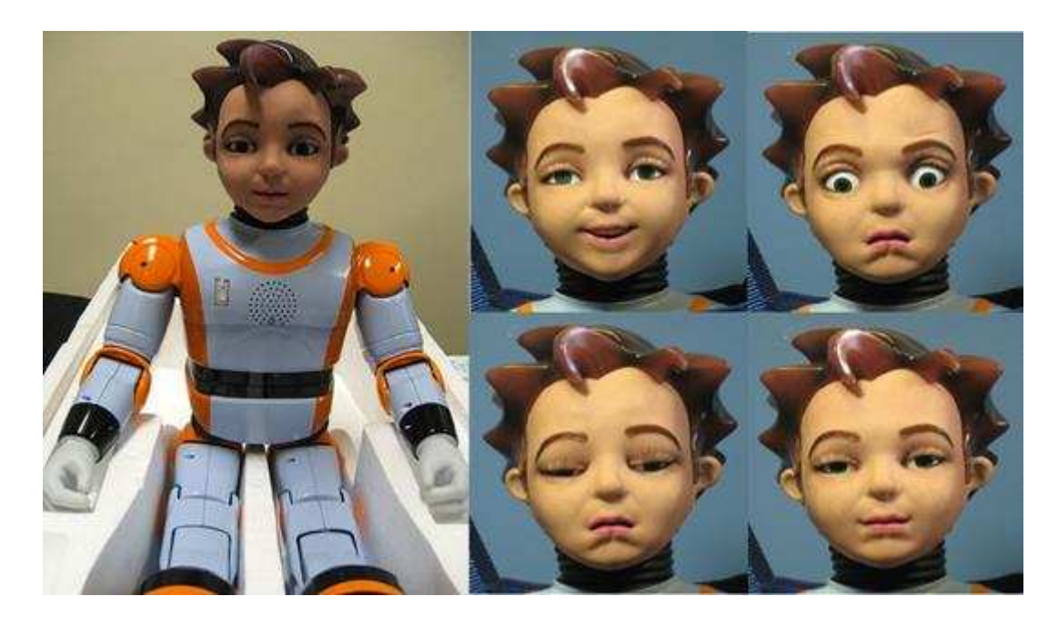
Figure 1. The Hanson Robokind Zeno R50 robot with example facial expressions

Zeno R50 (Hanson et al., 2009) which has a realistic silicon rubber ("frubber") face, because this can be reconfigured, by multiple concealed motors, to display a range of reasonably lifelike facial expressions in real-time (Figure 1).