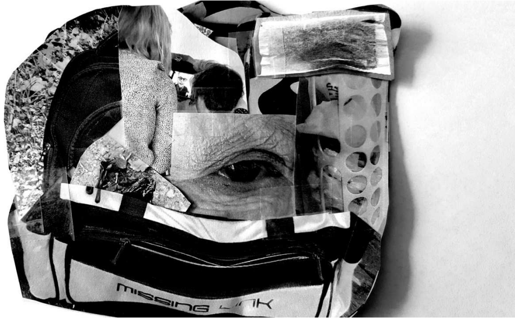
Figure 2 Cut

Cut. Bodies are troubled by those who appeared virtually in bags. Bodies-in-bags (I-Pads, Skype, Neil, Mirka Angelo) as fleeting figures of the absent/present, attendance as virtual and partial contained within bags. How might this text encompass these virtual engagements? How might these multiple I/i as thinking/writing/doing be remembered? Grosz's (1995, p. 21) question about 'the ways in which the author's corporeality ... intrudes into or is productive of the text' helps us re-member (materially reassemble) the traces of the then-virtual, now non-existent conference performances. Bags as unwavering and unwitting participants in their own representational capture of past, current and still-to-be events. Travelling onwards. Still sweaty in hearing those recordings, the virtual-material trace of bodies-in-bag-species.