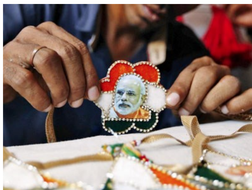
Figure 1. Ornamental raakhi with Prime Minister Modi’s photo

Immediately after the election of the Bharatiya Janata Party (BJP) government in May 2014, there was an acceleration of both an aggressively market-oriented neoliberal economic agenda emphasising an open and ‘modern’ capitalist economic model and a conservative social agenda emphasising ‘traditional’ values through a combined patriarchal and Hindutva ideology. This paradigm was crafted through a converged promotion of Hindutva and neoliberalism, with women projected as receivers of gifts and ‘protection’, rather than having ‘rights’ or entitlements. This was the focus of the Pradhan Mantri Jan Dhan Yojana (PMJDY) 1 scheme launched in August 2014. PMJDY was announced in time for the occasion of Raksha Bandhan (translated literally as ‘bond of protection’), when sisters (real or figurative) tie a thread on the wrist of their brothers (real or figurative) and in return receive gifts or money as a symbolic ritual about the ‘protection’ that is promised to the sisters by the brothers.