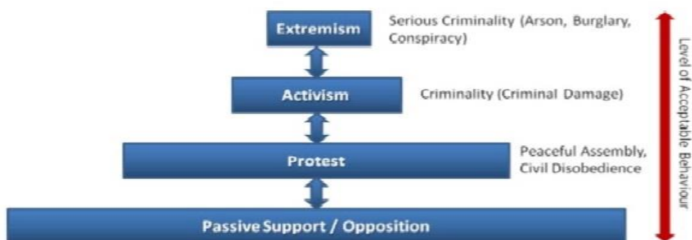
Figure 1 – The Structure of Protest, taken from ACPO (2015) Policing linked to Onshore Oil and Gas Operations , London: National Police Chief’s Council, 8.

The diagram and explanation are included as part of a discussion about the benefits of establishing good relationships with protesters and local supporters at anti-fracking protests, in line with the commitment to dialogue. The breakdown of the structure of protest here though defines protest in terms of accepted tactics in distinction to activism defined by criminality. Here the divide between these groups mirrors the distinction drawn between ‘contained’ and transgressive protest that Gillham (2011) argues has been central to targeted protest policing in the US in recent years. Indeed, the Network for Police Monitoring [Netpol] have pointed out, ‘the guidance proposes that these categorisations will be used to ‘tailor’ police responses’ (2015a: 9).