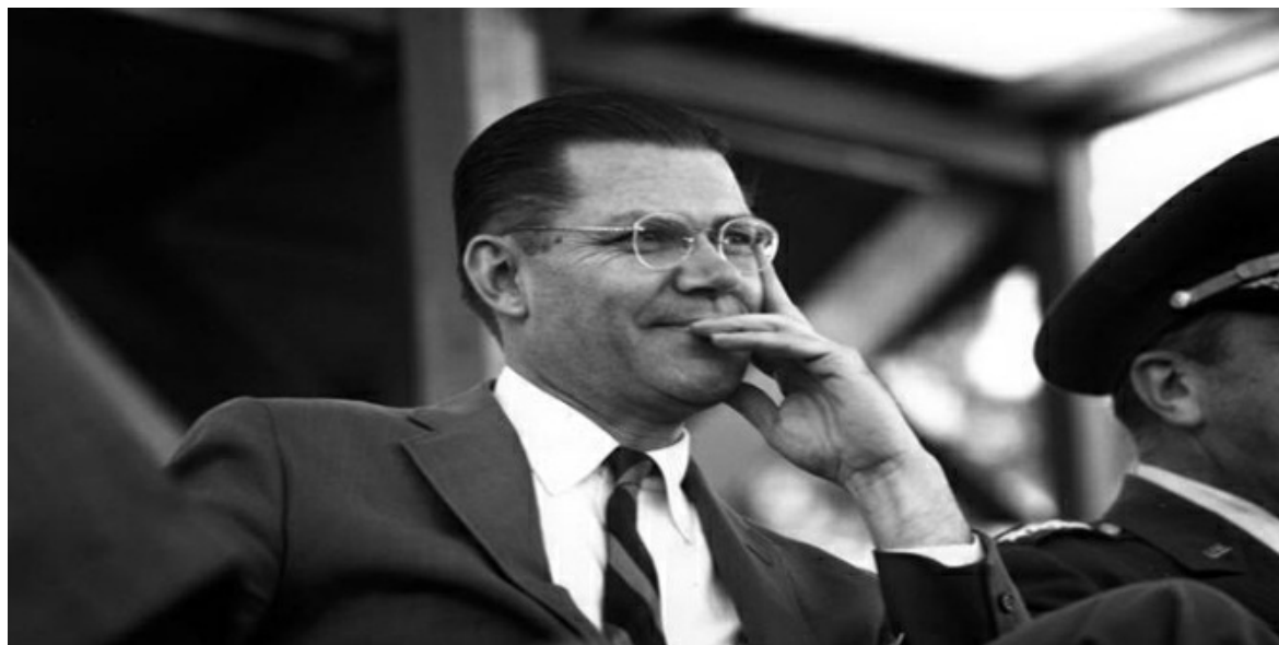
Robert McNamara, US Secretary of Defense, Fort Bragg, 12 October 1961

Within the book are intriguing hints that McNamara was not well-liked by staff. It seems he worked them very hard. Upon retirement, he was gifted the traditional clock, but subject to an ironic twist – the clock was said to represent the precision with which he ran boardroom meetings (160). That was the level at which he was most comfortable. In fact, he had rarely met mid-level employees, and at times morale in the organisation was very low. His highly proficient Bank staff complained that they felt as workers might on an assembly line (142). One official declared that the object of the organisation was just to go out and make loans, and that many of the projects of the bank folded (128). What mattered were the balance sheets. In other words, in the spirit of Henry Ford, he had made the Bank into a credit factory.