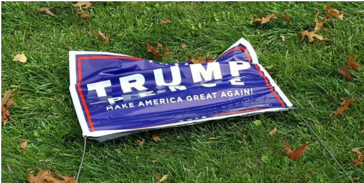
“trump sign – 2016-11-08”