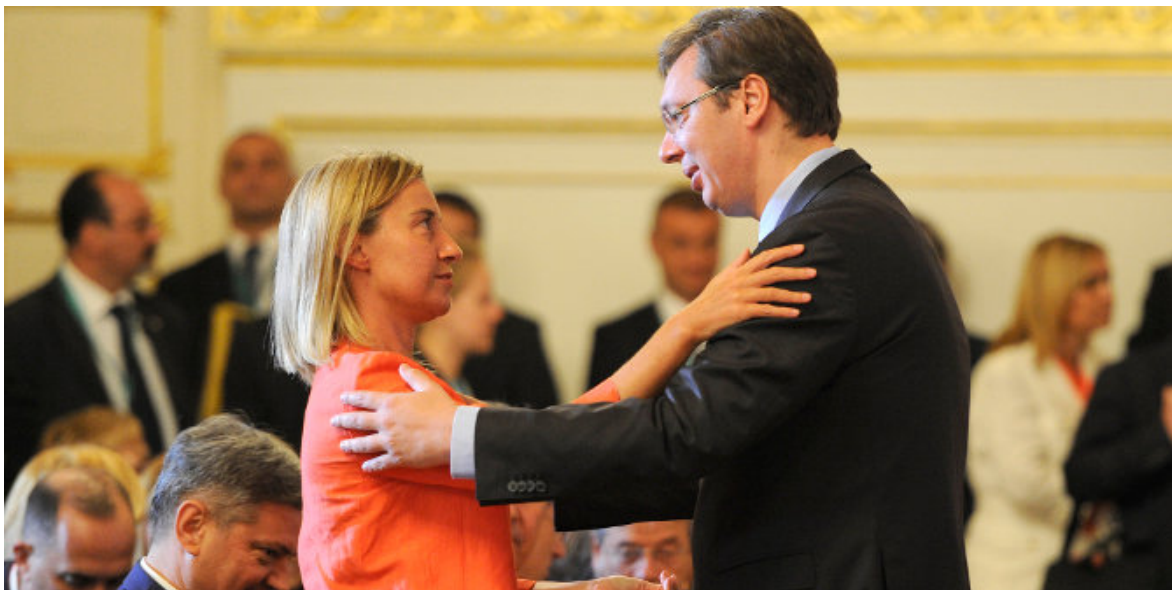
Federica Mogherini and Serbia's Aleksandar Vučić at the 2015 Western Balkans Summit

The last state to join the European Union was Croatia in 2013, but when can current candidate states expect to secure their accession to the EU? Tina Freyburg and Tobias Böhmelt present results from a new study of the capacity of candidate states to meet accession criteria. They find that only one of the current candidate states (Macedonia) would be projected to meet the criteria by 2023, with Serbia and Turkey likely to succeed by the mid-2030s, and Albania and Bosnia-Herzegovina unlikely to meet the criteria before 2050.