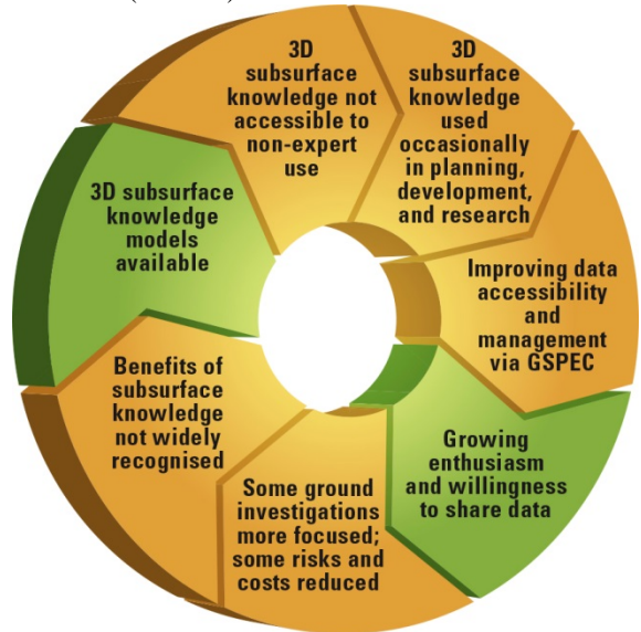
Figure 1. Current data delivery and exchange within GCC and public and private sector organisations in Glasgow. Green shading indicates areas functioning well; orange shading indicates areas which are weaker, but improving.

required data from the different volumes of the ground investigation reports and the disconnects between the data, uncertainty in measurement datum and units (Table 1).