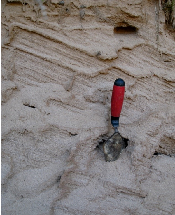
Figure 54. Contorted silt partings and shearing in sands, Kinloss Country Golf Course sand pit.

The thin pebbly brown sandy diamict (Fig. 53) that caps the ridge at Miltonhill was also exposed in a temporary working on the golf course at the top of the ridge, at c. 30 m OD. The diamict rests on planar-bedded, fine-grained sand with silt drapes, showing some minor signs of fluidization (flame structures). Some climbing ripple lamination and small-scale cross bedding is present within individual sand beds. The matrix of the diamict is contorted and boudinaged blocks of more competent silty material, which occur its base, are associated with injections of fluidized sand from below. This diamict is remarkably similar to that described by Peacock et al (1968) as the ‘brown boulder clay’ they mapped capping the remainder of the ridge, around Hempriggs and Coltfield.