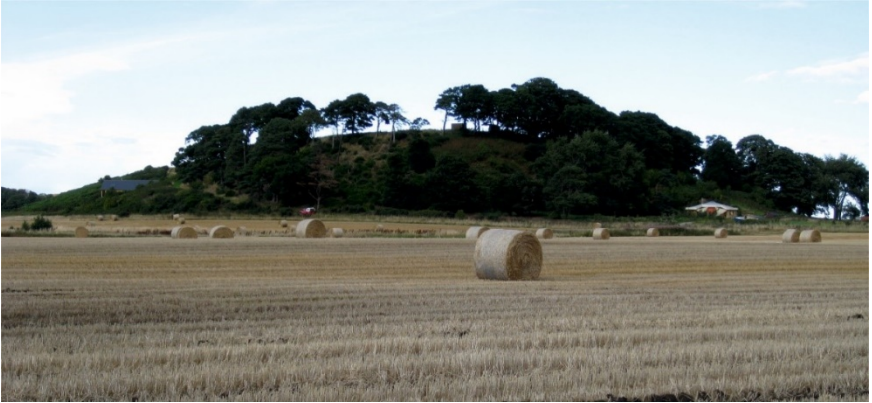
Figure 50. The western side of Grange Hill, showing steep, tree covered possible ice-contact slope.