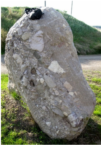
Figure 52. Erratic of Upper Devonian conglomerate on the Kinloss Country Golf Course at Miltonhill.