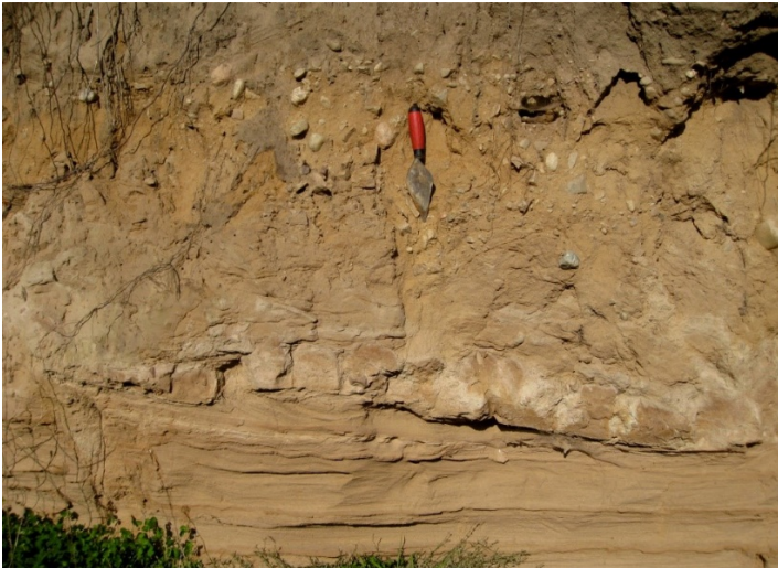
Figure 53. Pebbly orange-brown sandy diamict with contorted stratification overlying planar bedded sand at the top of the sequence in the sand pit at Kinloss Country Golf Course. The involutions and boudinage in the diamict are probably caused by cryoturbation and by injection of fluidised sediment from the underlying sand.