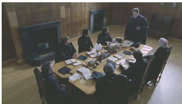
Illustration 15. The doctor speaks in front of the tutors. Time 12:57.

Also, the principles of Arnold's pedagogical reform are staged when he convincingly argues his ideal to the group of teachers: «All the boys will have considerable responsibilities but they will be taught in pastoral care and Christian love, not in an atmosphere where only the strongest and the cruellest survive» (illustration 15). Moreover, Dr Arnold is described as a human being able to make mistakes, feel bemused by the chaos and even sometimes nearly overwhelmed by the circumstances. Having all these features considered, Dr Arnold apparently defends the weak against the strong with a great effort and instils love and sympathy among the schoolboys.