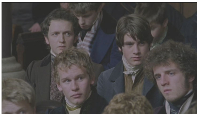
Illustration 16. Creating bonds of communication. Time 24:51.

Likewise, the figure of Dr Arnold stands for a fraternal authority who would carry out justice to everyone without caring who the father of the student is. The Doctor, henceforth, takes a real active role, every time he appears to warn or punish the bully. To perform this point, Dr Arnold's image results in a symbolic father by establishing a relationship of confidence, as expressed in «I will believe each boy's word as I will believe a man's word» (illustration 16). To some extent, this sentence strengthens bonds of communication between the schoolboy and the headmaster, but this is a double-edged sword with its downsides. Since the youngsters are going to be men, they will be treated like them.