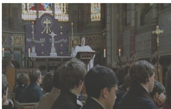
Illustration 11. Interior shot of the chapel. Time 24:03.

This indoor setting has nothing to do with the simple outlook in Stevenson's film adaptation. The abundance of luxuries is widely displayed around the chapel. For example, some large painted windows, many golden decorations on the wall and two large crosses: one in silver and the other one in gold. From all this it can be easily interpreted that these schoolboys belong to wealthy families, and consequently, to a particular social class 28 . This time Dr Arnold is performing in a closer position rather than in a top pulpit when he says «A place of light and learning and goodness» (illustration 11). In contrast, he is preaching with his right hand lying on an open bible (illustration 12).