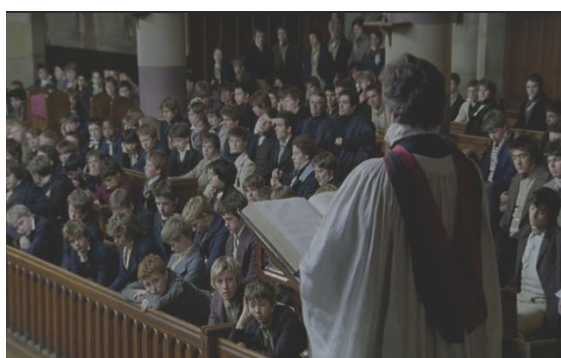
Illustration 13. Schoolboys in the sermon. Time 24:14.