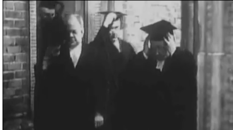
Illustration 8. Tutors leaving the chapel. Time 9:19-9:24.