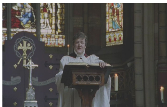
Illustration 12. Holding his hand on the open Bible. Time 24:48.