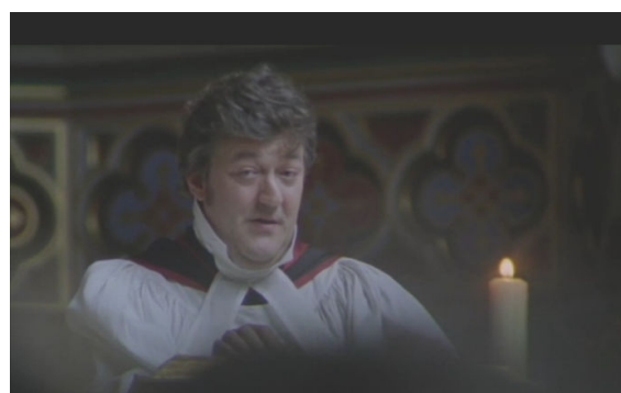
Illustration 14. A teaching lesson. Time 25:28.

Also, the principles of Arnold's pedagogical reform are staged when he convincingly argues his ideal to the group of teachers: «All the boys will have considerable responsibilities but they will be taught in pastoral care and Christian love, not in an atmosphere where only the strongest and the cruellest survive» (illustration 15). Moreover, Dr Arnold is described as a human being able to make mistakes, feel bemused by the chaos and even sometimes nearly overwhelmed by the circumstances. Having all these features considered, Dr Arnold apparently defends the weak against the strong with a great effort and instils love and sympathy among the schoolboys.