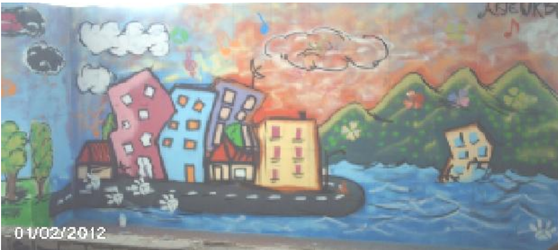
Photo 3. Graphite produced by young participants in one of the editions of Project ArteUrbe.

These other activities are relied on contributions in the area of social psychology that consider the possibility of thinking the group practices “as gadgets 3 – singular combinations and heterogenic components – that open certain fields of visibility and sayability, at the same time they obscure analog fields” (Rodrigues, 1999, p.162). The visibility and sayability that is aimed to invest in aesthetic workshops are from other voices, discordant in relation to forms of seeing and living instituted; voices that concern the possibility of diverse relations with the city, with others and with oneself; that contribute to the invention of singular ways of being, with the come to be.