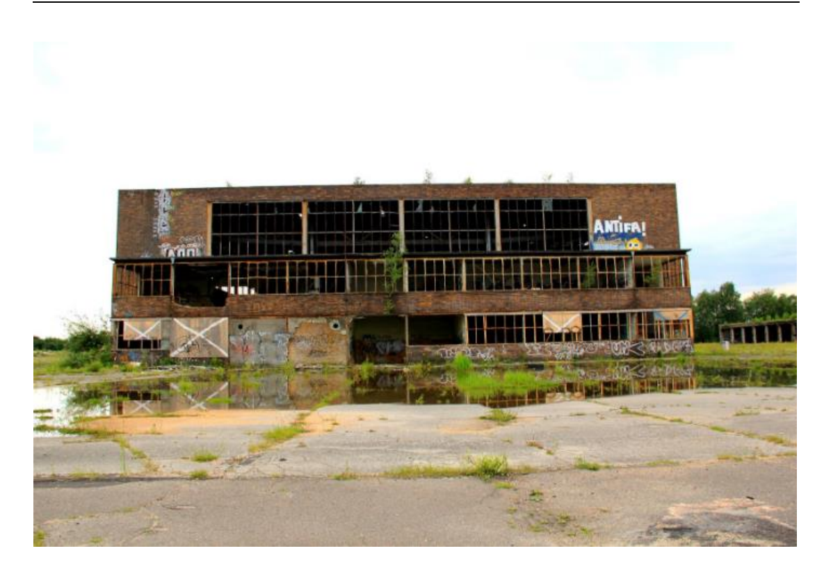
Fig. 5. Oranienburg Airfield before renovation

One day, after one of our explorations together, Fahey and I saw a historical industrial complex that was being renovated. The works were about to finish and one of those monumental advertising posters was placed in the main entrance detailing the features of the new apartments that were being constructed. I asked Fahey if he could figure out the cost of each unit and he told me that some days ago he had checked on the website of a similar project where they were selling condos starting from €500,000. He said: "These guys are crazy, in Berlin there aren't too many people who can afford such prices. These are clearly addressed to external investors who basically offer the apartment for renting the day after they buy it" (personal fieldnotes, 6 July 2014).