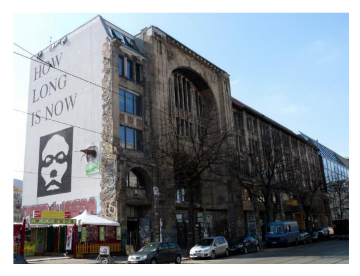
Fig. 7. Tacheles

"It's owned by a bank and they gave a 10-year lease to the squatters, or rather the artists. They turned it into an art centre, did their own thing for 10 years. It's a very short time for a bank because in the meantime the property prices go up and up. It's actually an investment since having artists there helps prices rise by making the area trendy and cool. What really pissed me off about the situation is the fact that that the city did nothing to save it. [...] Tacheles also had the bistorical importance of being the first place to broadcast a live sporting event to the world, during the 1936 Olympics. For me Berlin did the wrong thing just by letting it close down. Now the bank will turn it in into a shopping center or some such: you will have H&M, Jack & Jones, and all these other shops moving in which have nothing to do with Berlin or its history" (personal interview, 25 April 2014).