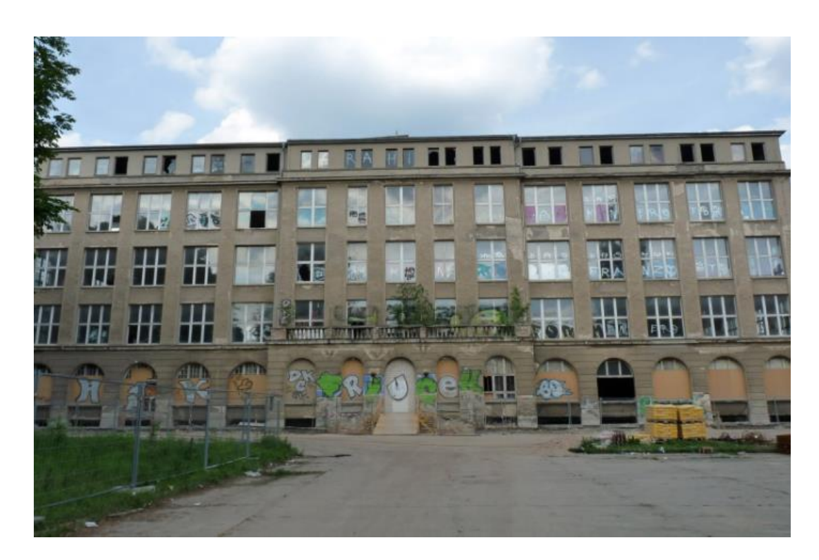
Fig. 3. Garbáty's Factory before renovation