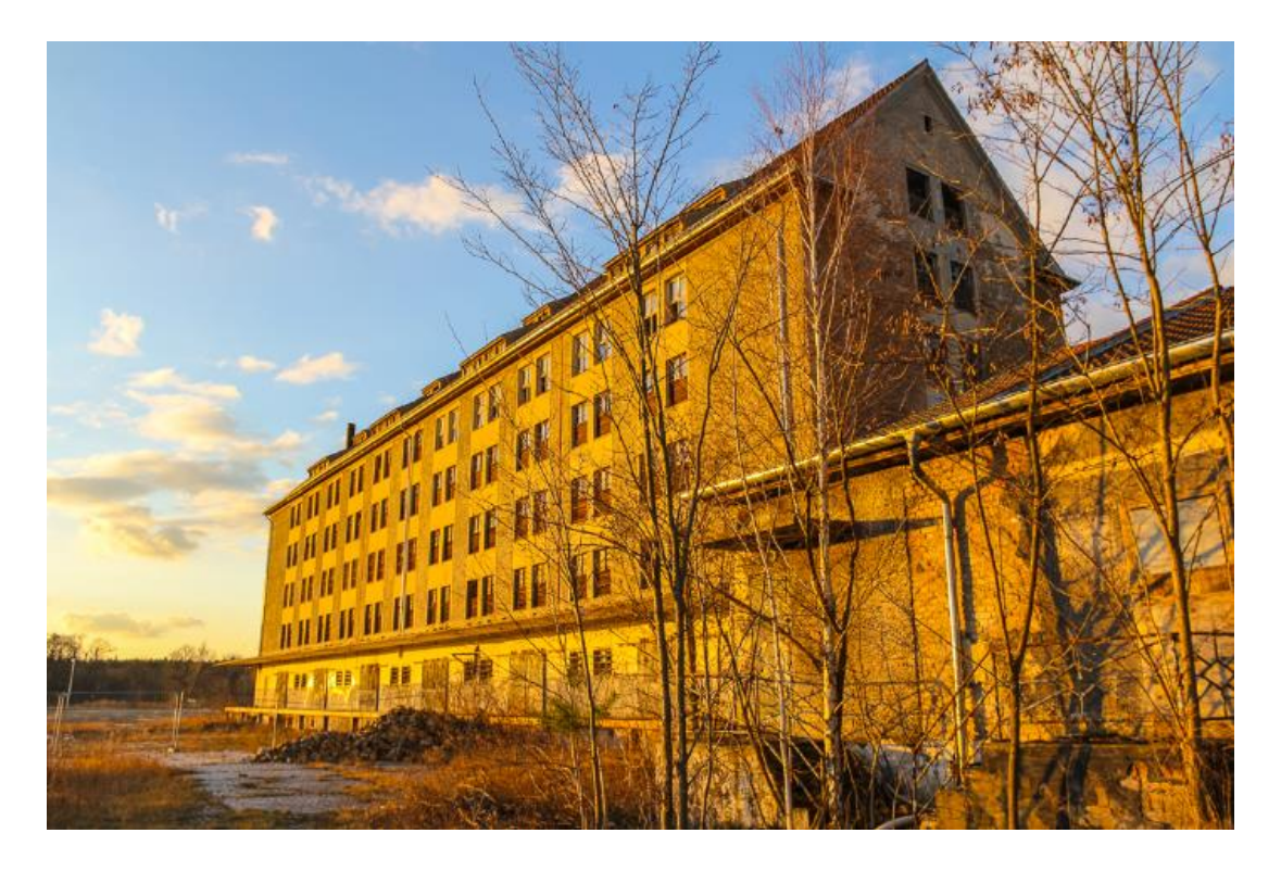
Fig. 2. Wünsdorf

"The seen lot of places where heritage can help to develop a whole region [...] You see it in Hessen, former industrial landscapes developed into parks and people can walk there, everything is safe, and it helped to attract a lot of tourism to cities now. Wünsdorf [the former headquarters of the Soviet army in Berlin; (Fig. 2)] is really big and you could do a nice hotel for rich people and that's O.K. because they bring the money to develop the place. But you also have to keep areas that could be open for the public" (personal interview, 27 June 2014).