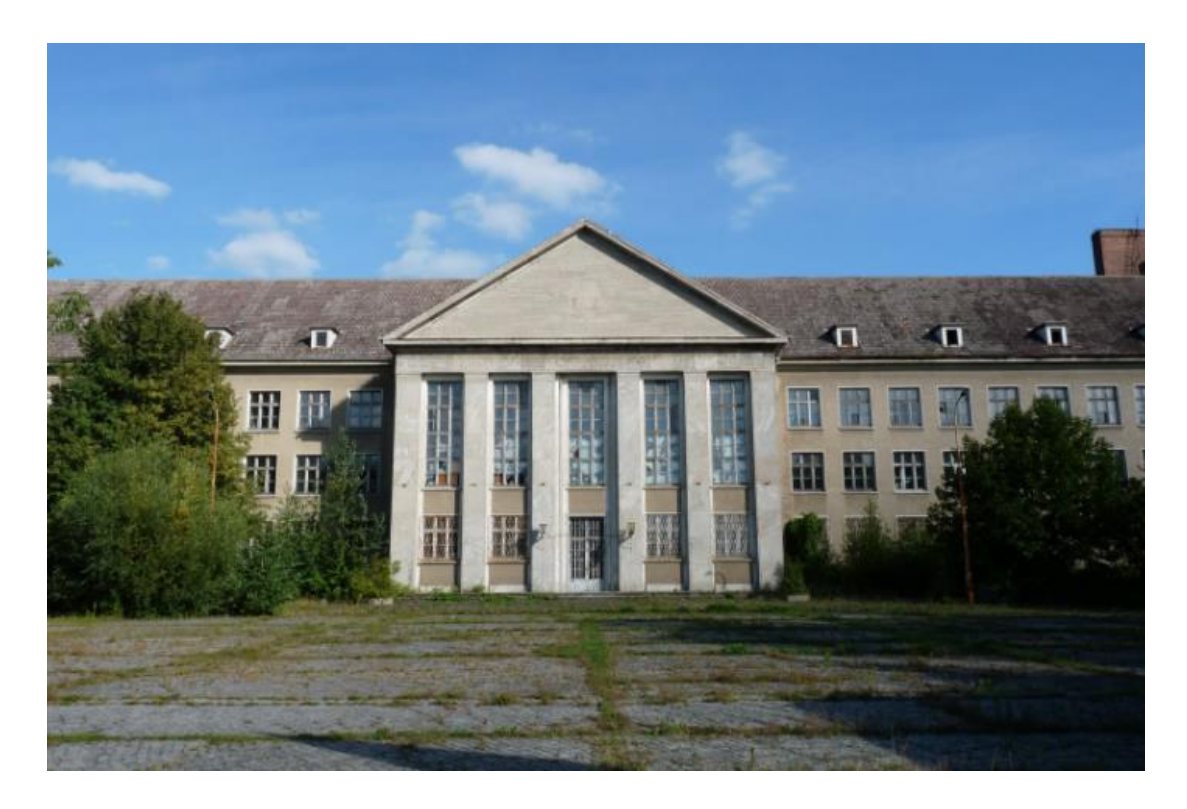
Fig. 4. Soviet Military Administration Headquarters in Karlhorst before renovation Source: Ciarán Fahey, 2010. Reproduced with permission of the author

Fig. 3. Garbáty's Factory before renovation Source: Ciarán Fahey, 2010. Reproduced with permission of the author