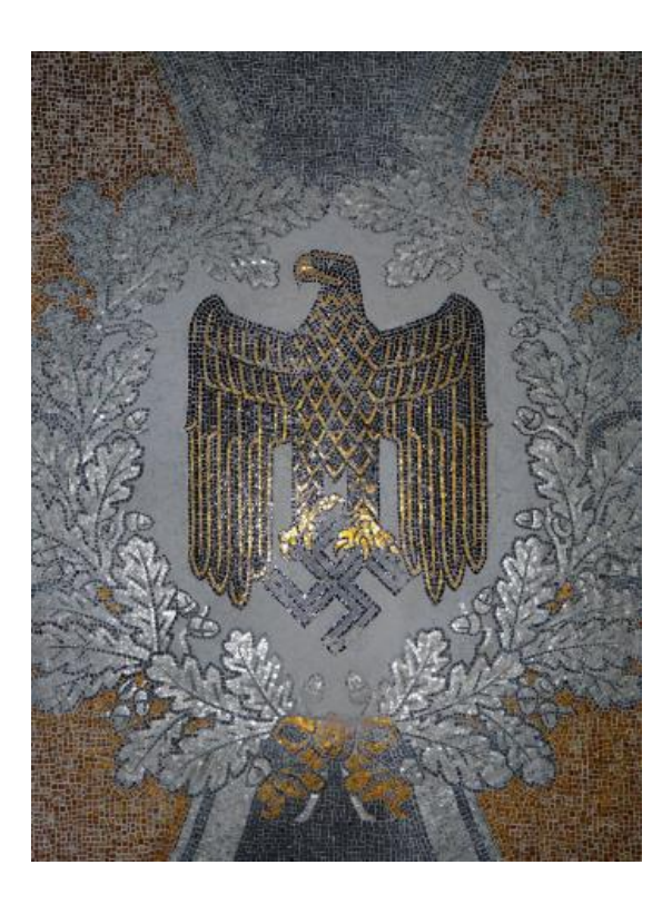
Fig. 1. Original Nazi mosaic at Krampnitz

However, the influence of 'Abandoned Berlin' is not merely to breed the ground for armchair exploration. As a website, its intangible property is to provide the actual possibility of feeling an abandoned building and its uncertain nature. This has a lot to do with what Garrett (2011b) describes as 'mutable qualities of decay' meaning that every exploration is different from the other. Indeed, taking a look to the hundreds of comments in 'Abandoned Berlin' it is easy to find people's interest in recounting their own experiences because they always vary. Many comments start by 'I was there last week and...' or 'I've always seen this place from outside but when I got in...' It is hard to imagine such a thing in mass tourism destinations like the Eiffel Tower of the Coliseum, where the experience is already set up and everyone is expected to come across it in the same way.