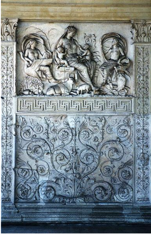
Figure 1: The Ara Pacis or Altar of Augustan Peace built to celebrate the first Roman Emperor. It symbolically represented the claim that the Emperor was the source of common wealth and prosperity(. A goddess, sits amid a scene of fertility and prosperity with twins, perhaps symbolizing the mythical founders of Rome on her lap.