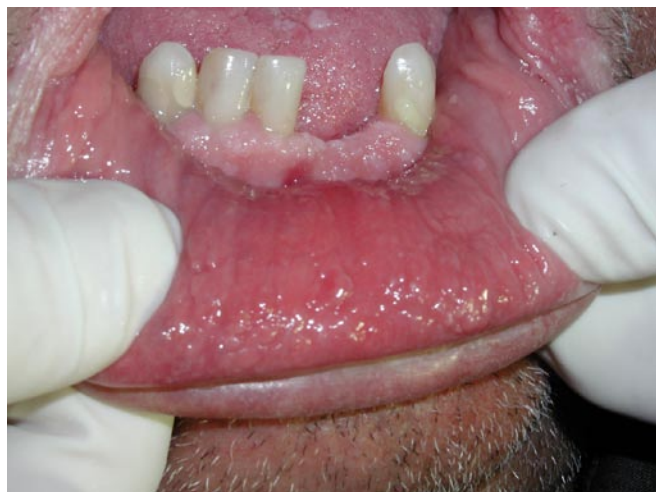
Fig. 2. Intraoral lesions in lip mucosa, low vestibular gum and back of tongue.