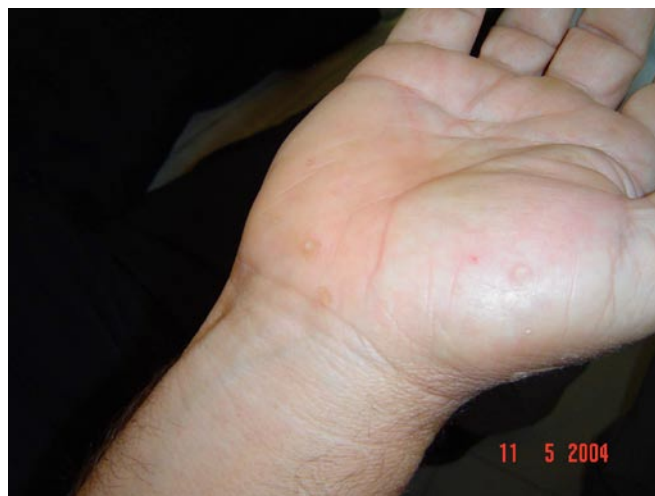
Fig.1. Palm keratotic lesions.

Oral examination reveals: partial loss of teeth in lower jaw, total loss of teeth in upper jaw (carries complete upper prosthesis), deep palate and fissured tongue. The mucosa is covered by