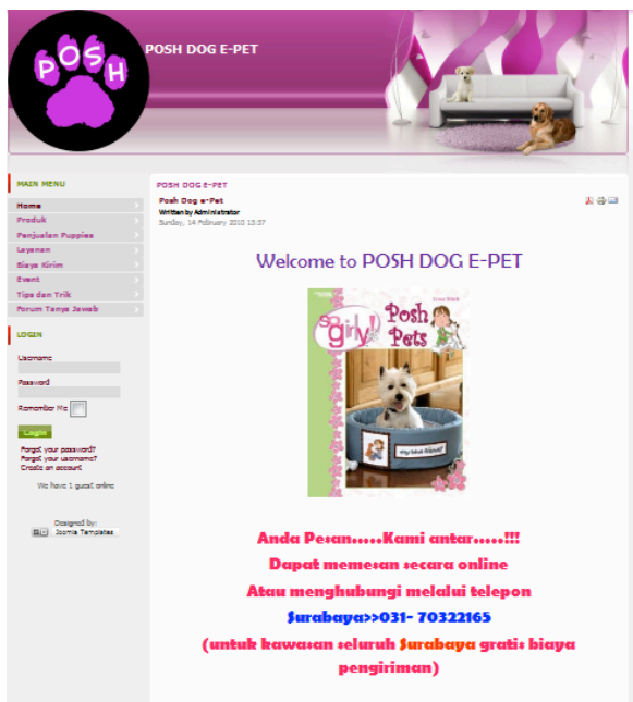
Figure 4. Website for Customer

For the website, template colour will be decorated with purple and white, because purple means elegant. This website has menu like home (Contact person, dog for sale, mobile pet salon or pet shop promotion), product (food, vitamin, snack, shampoo, perfume, etc.), puppies (variety, sex, colour, date birth, age, father's name, mother's name, certificate, vaccine), service (for 2 or 3 channels), delivery cost (link to JNE), events (link to PERKIN), tips and tricks, and FAQ.