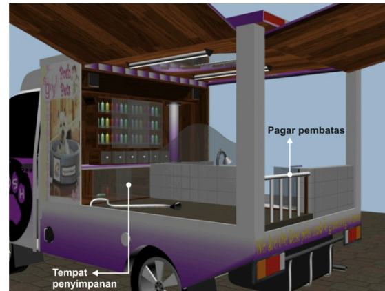
Figure 3. Mobile Pet Salon Design

communication with the seller, and variety of products must be completed.