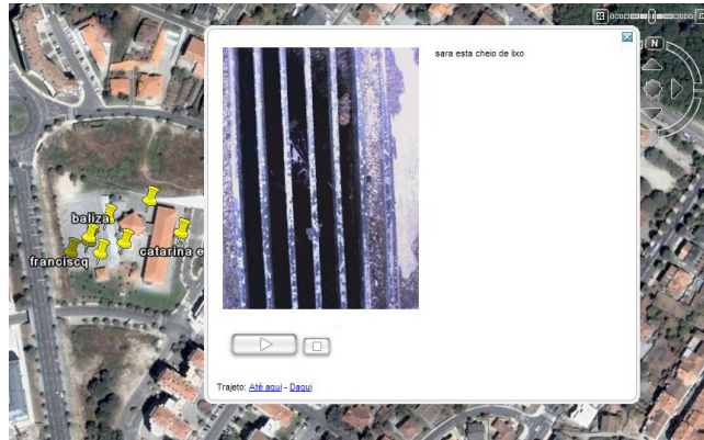
Figure 3: An MMS message displayed in GE