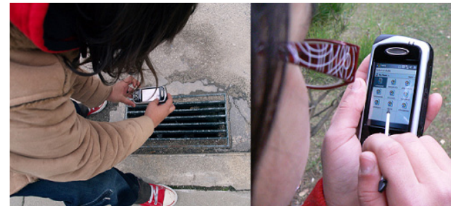
Figure 2: a) and b) A child composing a message that reports a run-off problem