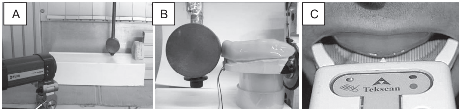
Figure 2: A) Thermal camera, B) Impact pendulum and piezoelectric sensors, C) T-Scan® III

temporalis, with the MOM, the BBM and the CCM4, during box practice, at rest position and clench.