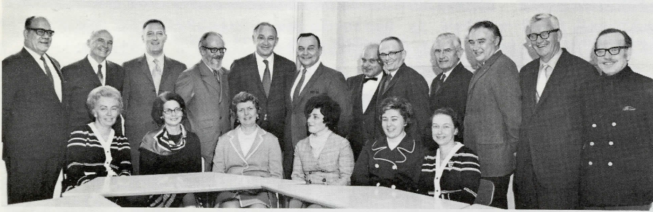
Class of 1945