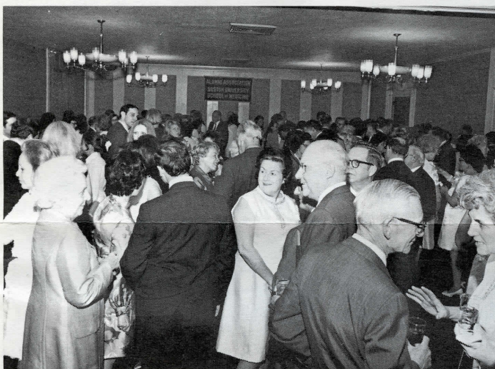
Alumni, graduating seniors, and their guests, seem to be enjoying the social hour.