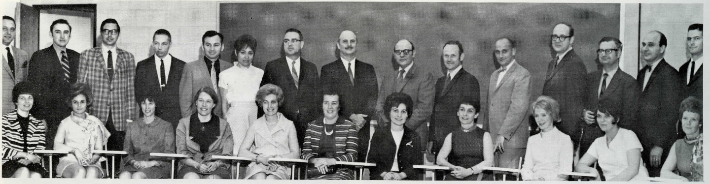
Class of 1960