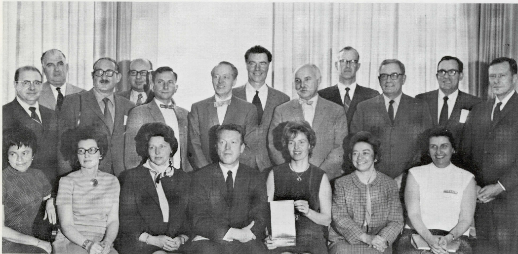
Class of 1950