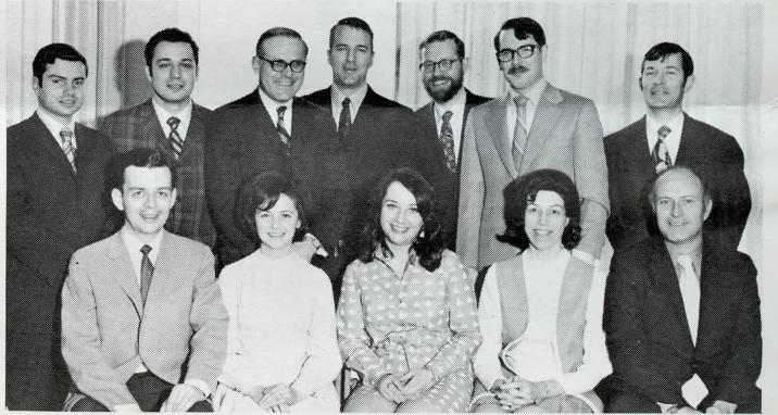
Class of 1965