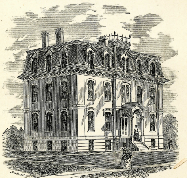
View of the College Building, on East Concord Street, opposite City Hospital.