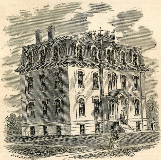
View of the new College Building, on East Concord Street, opposite City Hospital. See Plan of Grounds on second page.

BOSTON: PUBLISHED BY THE TRUSTEES, AND TO BE HAD GRATUITOUSLY AT THE COLLEGE. 1871.