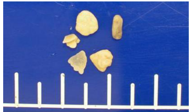
Figure 4 Macroscopic pathology slide. Small yellow stones measuring from 3 to 5 millimeters in diameter.

sibility of benign hyperplasia of the prostate has to be considered as well. Finally, urinary retention may be the result of urinary tract stones. Although, bladder calculi are now less frequently encountered in United States they can be found occasionally in TBI patients. In the general population, bladder stones are usually associated with bladder outlet obstruction, urinary infections, radiation, schistosomiasis, bladder diverticuli and foreign bodies such as Foley catheters and prostatic urethral stents [4,5]. The vesical stones may be single or multiple with variation in incidence reported from different authors [5,6]. In TBI patients, prolonged catheterization, retention of urine as a result of neurogenic bladder, and UTI may predispose to formation of bladder stones. Even though bladder stones may be completely asymptomatic, more often they present with suprapubic pain, dysuria, intermittency, hematuria, frequency, hesitancy and nocturia. They may also present with sudden termination of the ability to void due to a lodged stone in the urethra [6,7].