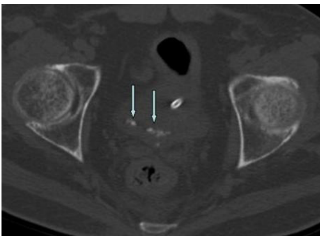
Figure 3 Axial pelvic CT scan without contrast. Note the multiple calcifications located in the dependent portion of the bladder demonstrating interval change in appearance (arrows).

Less frequently TBI patients may present with urinary retention. This may be due to detrusor sphincter dyssynergia (DSD) in which there is dysbalance of detrusor and sphincter muscles. Other more easily reversible causes such as clogged catheters or medication side effects can also possibly cause urinary retention and have to be ruled out first before diagnostic and treatment approach for neurogenic bladder is initiated. In older patients the pos-