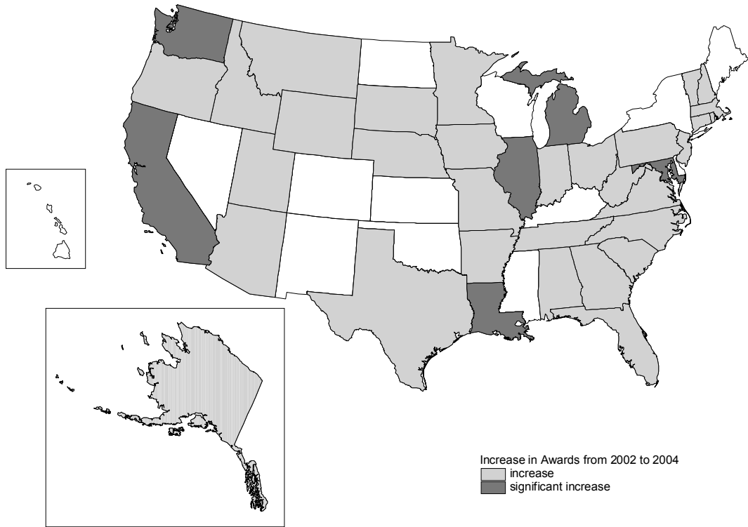
Figure 2. States with Increases in the Number of Awards to FBOs from 2002 to 2004