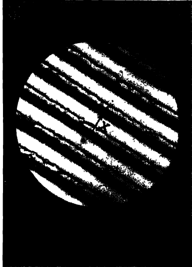
Fig. 2 A typical micrograph of a grating replica

The method underlying the measurement of d is as follows. Let the illuminated circle in Fig. 2 represent the image of the aperture fitted with the projector pole