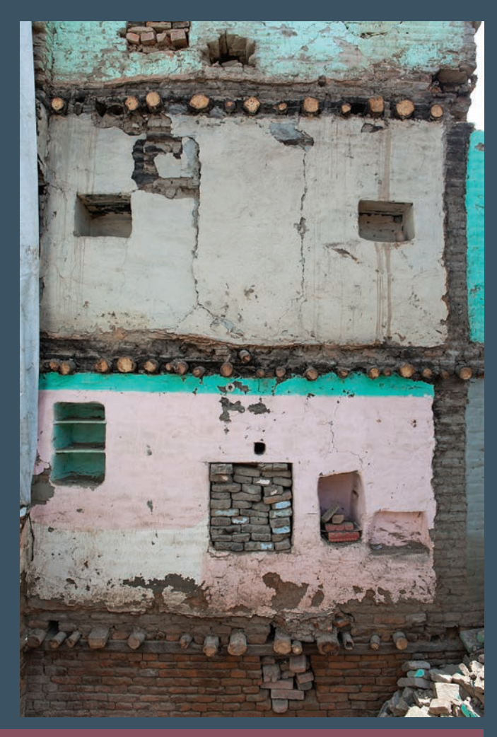
In a neighborhood on the east side of Bhaktapur, interior walls of family houses were exposed by the collapse of roofs and neighboring buildings.