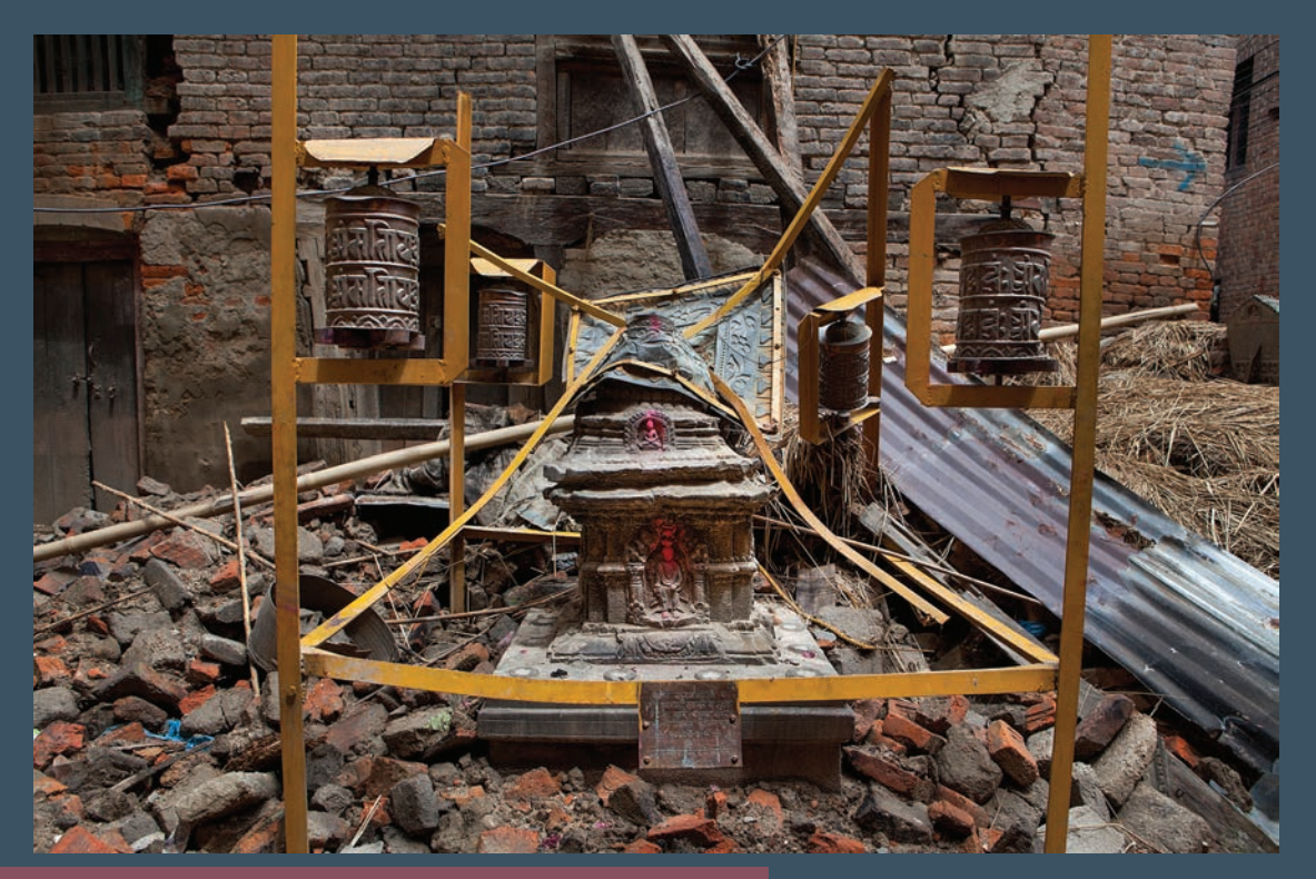
In the Chyasal neighborhood of Patan, Buddhist stone shrines, called caitya, and prayer wheels were damaged by falling brick and debris from the surrounding houses. This section of old Patan was damaged more severely than other neighborhoods.