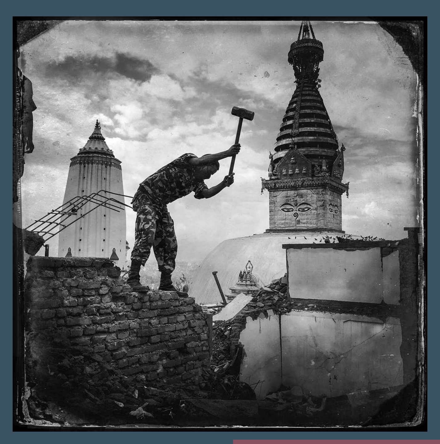
Members of the Nepal Army assisted in the demolition of unsafe shops and houses on top of the Swayambunath hill. The ancient stupa, or shrine, in the background, suffered no major damage.