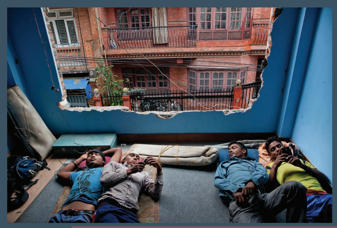
At mid-morning, laborers in Kathmandu's Naya Bazaar take a break from their heavy work tearing down buildings. These four young men came to Kathmandu looking for work after the earthquakes. They lived in the building that they were tearing down with eight other friends from villages in the southeastern Udayapur district. These workers, numbering in the several thousands across Kathmandu and other affected areas, were paid by the owners of the properties that they deconstructed.