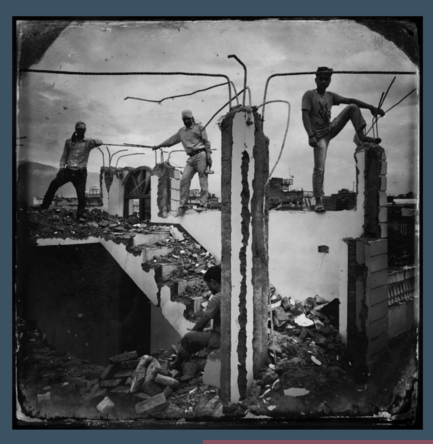
Demolition of concrete buildings continued through monsoon season downpours. Balaju, Kathmandu, Nepal.