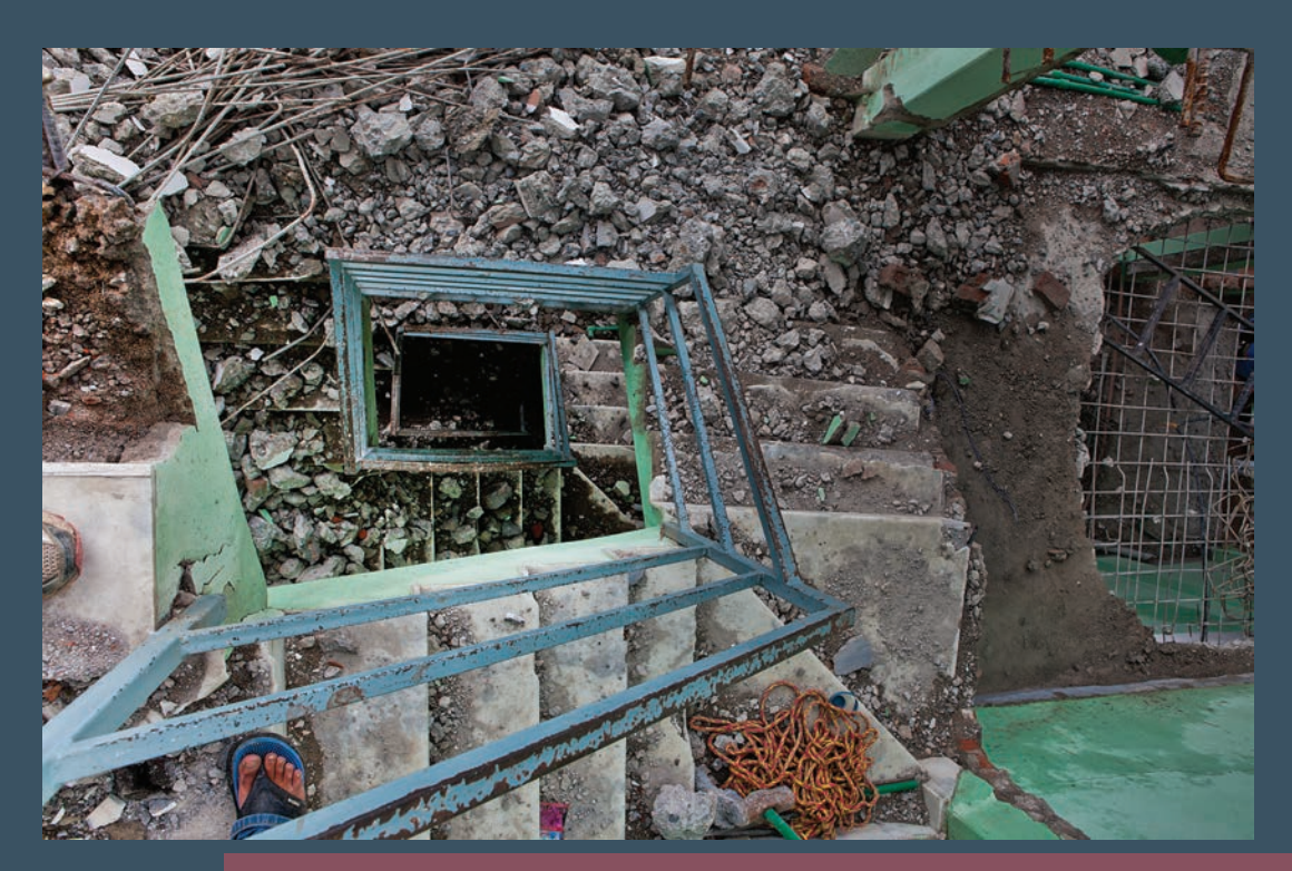
The fourth-floor\ stairway\ of\ a\ building\ under\ demolition\ is\ covered\ in\ rubble.\ Such\ stairway\ s\ became internal chutes for rubble to be brought down to ground level. Workers made holes by pick axing and hammering through concrete and rebar floors in order to let rubble fall down to the lower levels. This way, the demolition laborers did not have to carry heavy loads of debris down the stairs.