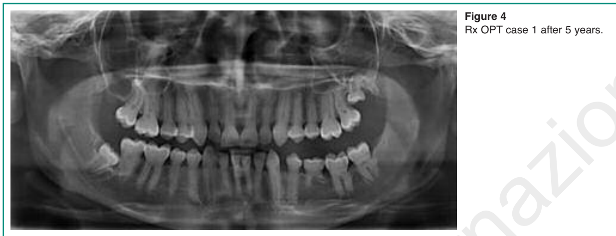
Figure 4 Rx OPT case 1 after 5 years.