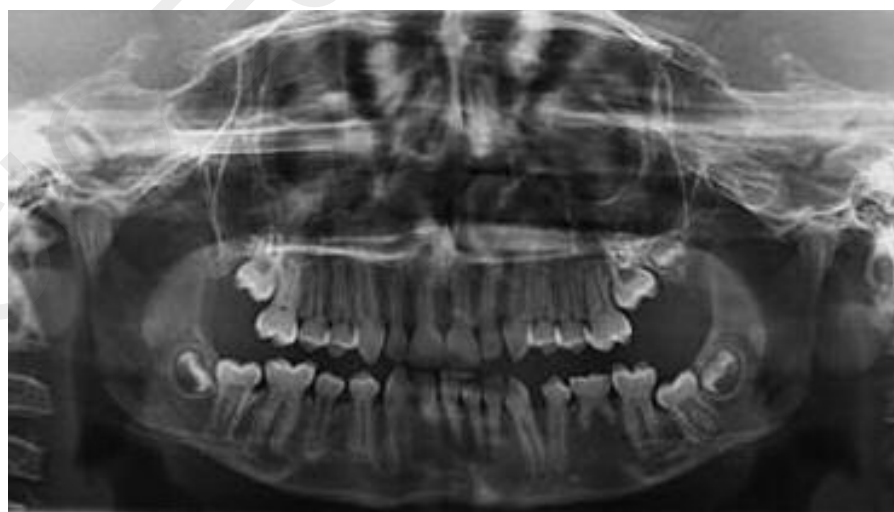
Figure 3 Rx OPT case 2 initial.