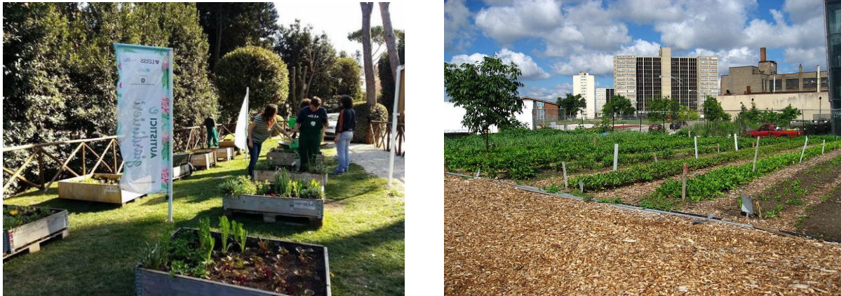
Figure 2: a) Project of Italia Nostra for Urban Gardens in Ostuni; b) Urban Gardens in Firenze; c) Vegetable gardens for autistic people in Perugia. d) Vegetables urban gardens in Chicago