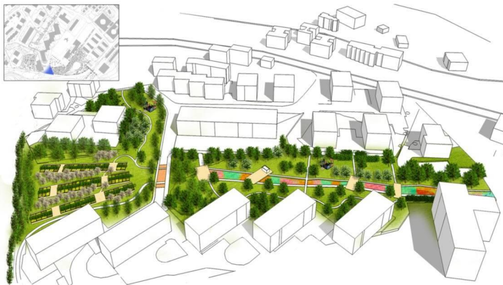
Figure 4. Landscape project for the Foibe Park in Perugia elaborated by the Department of Civil and Environmental Engineering (DICA).