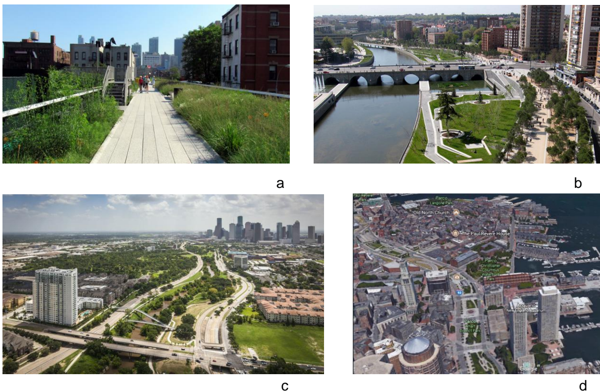
Figure 1: a) New York High Line (Image: creative commons); b) Madrid Rio (photo by West8); c) Buffalo Bayou Promenade, (photo by SWA Group); d) Boston, view by google

Examples are the New York High Line, which has become a famous place frequented by locals and tourists; the system of parks and public spaces along the Madrid Rio, the Rose Fitzgerald Kennedy Greenway in Boston, the Buffalo Bayou Promenade, and the interventions to build up urban gardens in many European cities (Figure 1).