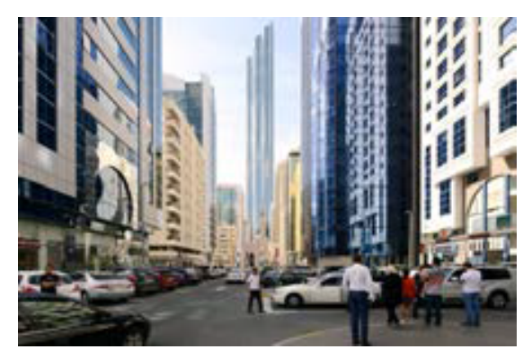
ABU DHABI, 2017 Downtown Abu Dhabi