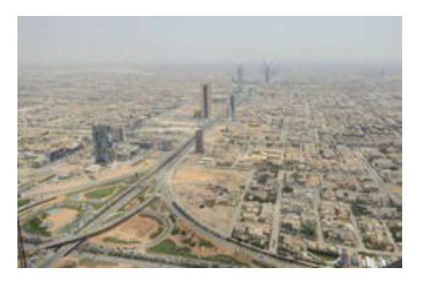
RIYADH, 2017 View from King Abdullah Financial District