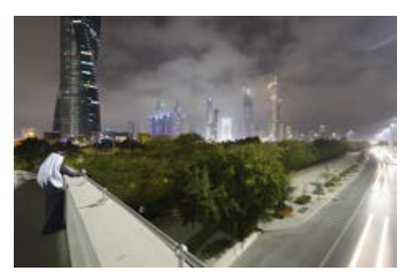
KUWAIT CITY, 2017 View from Al Shaheed Park