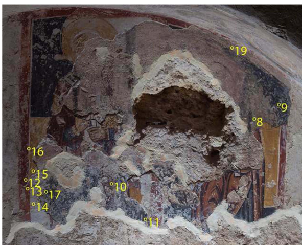
Fig. 2. Front (with XRF points map)

Blue paints (points 4, 6, 9, 11, 17) exhibit overwhelming counts for the Ca peak and also result in the Ca sum peak being observed at \sim 8\text{keV} , Fig. 8. Blue areas of pigment are shown to contain the same elements as other spectra, but in different quantities. The Ca/Fe ratio here is between 28-58, considerably higher, meaning there is comparatively less Fe content. Point 6 has the highest amount of Pb and also presents a small quantity of Ba. We do not assign any particular element to be associated with the blue colorant based on these spectra. We are instead able to rule out the presence of blue pigments based on transition metals (Cu, Co, Fe, Cr, etc.). This includes the conclusion that azurite is not present in the blue areas analyzed, since the representative Cu peak is not observed. The blue color could be of organic (C, H, N, O) or lightweight element (Na, Si, Al, Mg) base, not detectable by pXRF. The infrared image shows a strong absorption of infrared light by this blue paint and excludes historical organic pigments such as indigo.