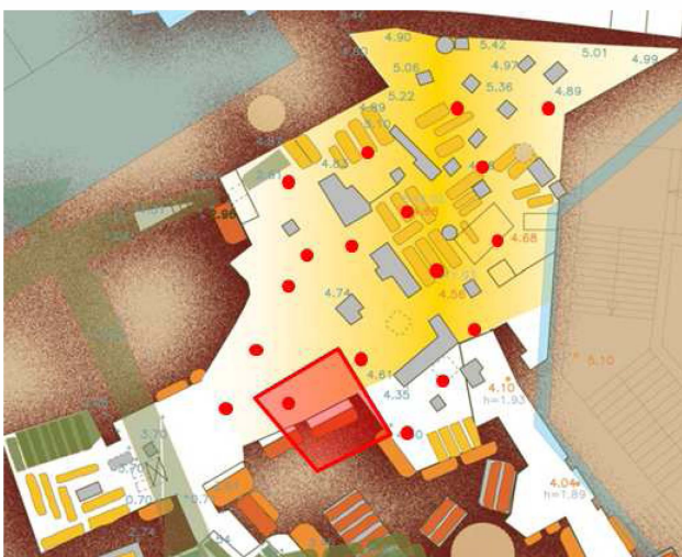
Fig. 1. Plan of the oratory with the scan positions highlighted (red dots)

The 3D data capture phase of the project took encountered the complex and fragmented structure of the space being surveyed. Particularities encountered were due to the presence of several pillars of pressed bricks, which support the ceilings, and the varying height of the ceiling. Specific considerations for this site focused on the need to document the recent excavations of the ground and wall tombs, the fresco palimpsests on the walls, the monumental inscriptions, and the graffiti of pilgrims.