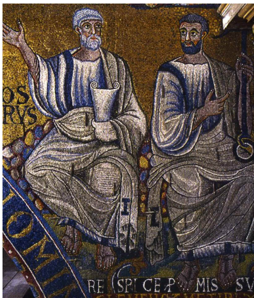
Figure 5. Sts. Peter (left) and Clement (right), apse arch of the Upper Basilica of S. Clemente (New S. Clemente), Rome