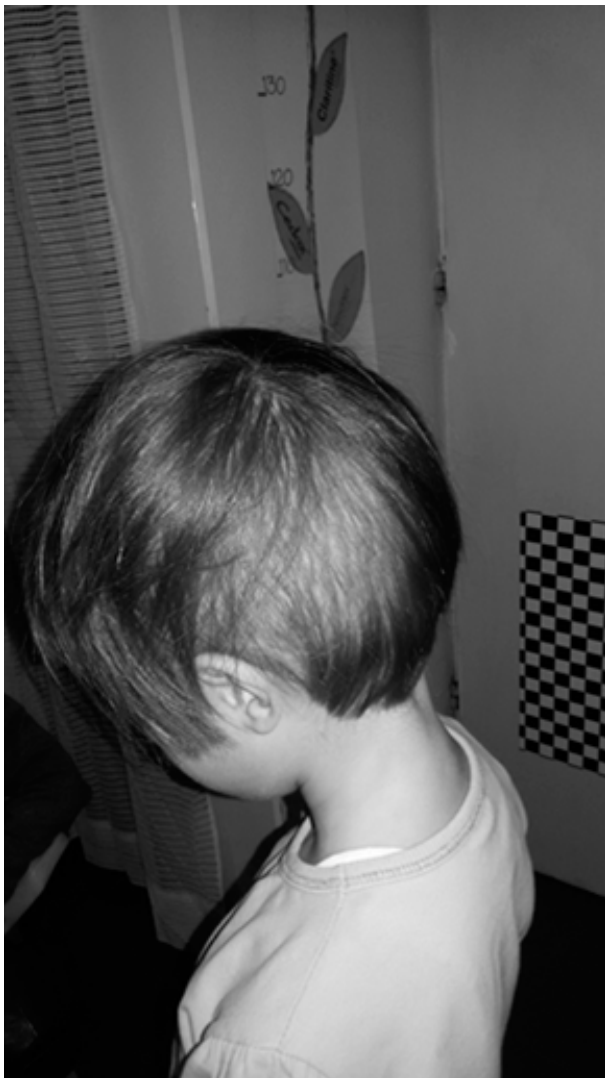
Figure 3. Scalp regions with reduced hair density (after the haircut)

information that child had been examined by a psychologist or psychiatrist before hospitalization, nor the information that the child attended school. External