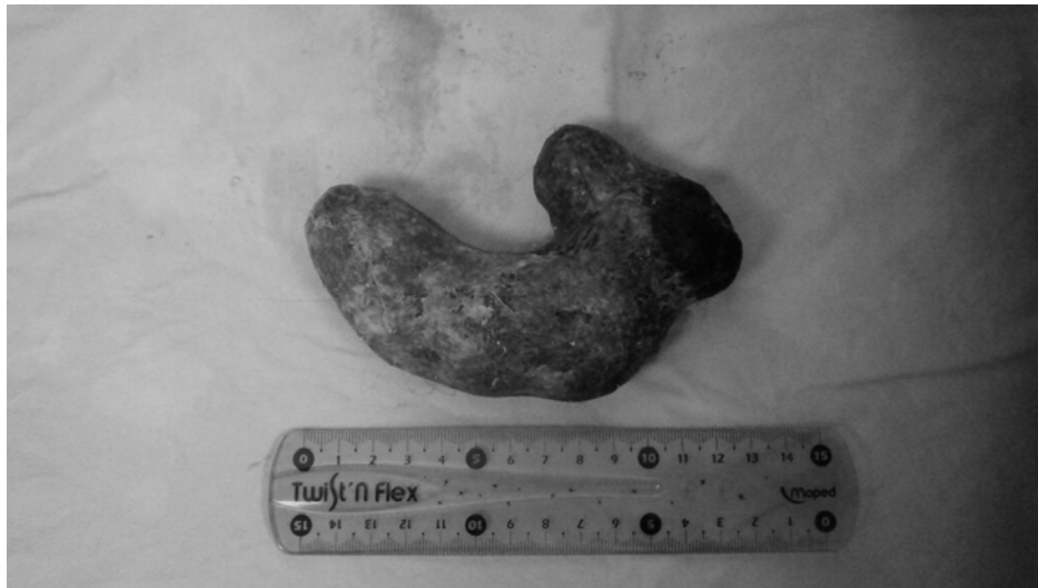
Figure 2. Gastric cast trichobezoar that was removed via gastrostomy