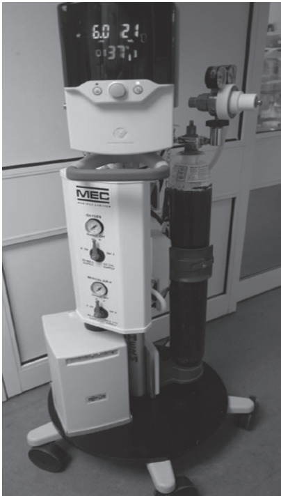
Figure 1. The mobile nHF unit