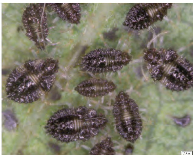
Figure 4. Nymphs were mostly dark with translucent yellowish parts on both sides and with spines, 11.7.2017, location Zakot

Slika 5. Jajne čahure i svlak ličike na donjoj strani otpalog hrastovog lišća, 17.11.2016., lokacija Zakot