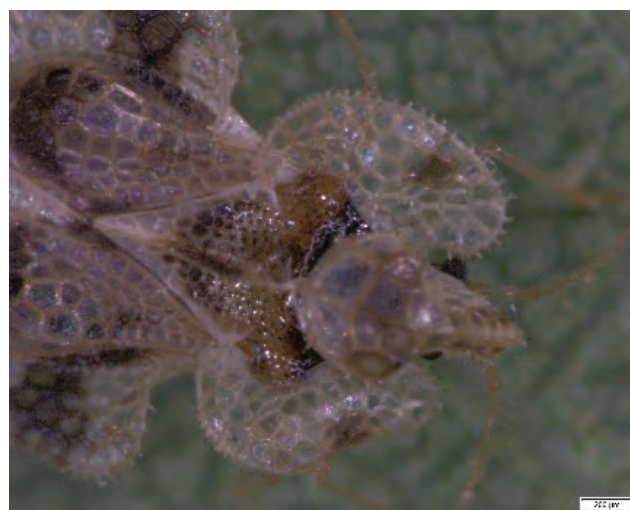
Figure 2. Detail of the head, C. arcuata , 11.7.2017, location Zakot

Slika 1. Hrastova mrežasta stjenica ( Corythucha arcuata ), 11.7.2017., lokacija Zakot