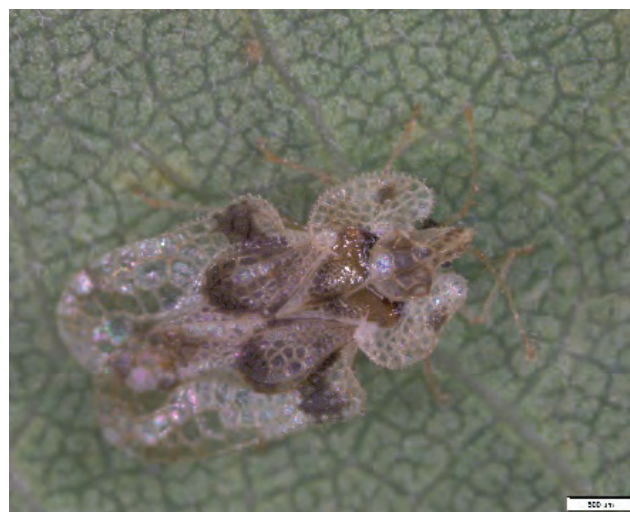
Figure 1. The oak lace bug ( Corythucha arcuata ), 11.7.2017, location Zakot