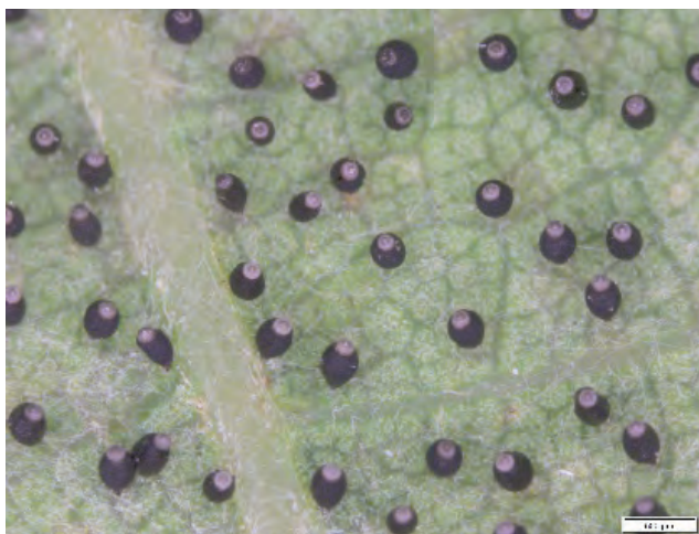
Figure 3. Cluster of eggs of oak lace bug on the underside of pedunculate oak leaves, 11.7.2017, location Zakot

Slika 3. Grupa jaja hrastove mrežaste stjenice na donjoj strani lista lužnjaka, 11.7.2017., lokacija Zakot