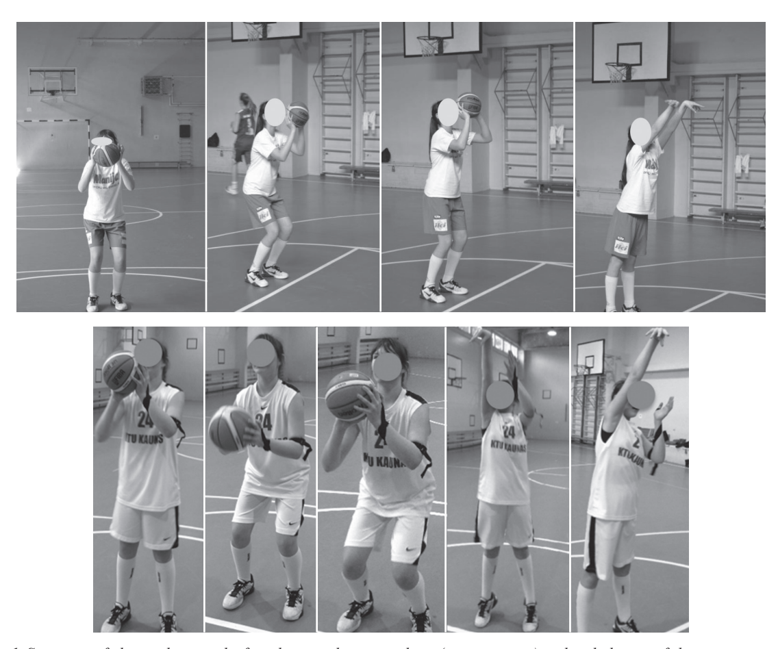
Figure 1. Sequence of photos showing the free throw technique without (upper images) and with the use of shooting straps (lower images).

coordinated to perform free throws with his/her mind clear of pressure and external information (Amberry, 1996). The result of the test was quantified as the number of successful shots expressed as a percentage of all the shots attempted. The exact same procedure was repeated after the intervention training in order to test the short-term effect of a shooting strap (after one month of practice). The retention of the shooting skill was tested one year after the intervention (long-term effect). In the test training sessions the players performed the same routine with warm-up activities and the free throws test (25 minutes). Afterwards, they continued with their training tasks and drills focused on tactical and technical aspects of the game (60 minutes). The tests were supervised by two expert coaches (observers to gather the data) with clear instructions of no interaction between them and the players. Then, the players received the initial information about how to do the tasks (free throws tests), but no feedback or support (i.e., emotional, performancerelated, social) were given during the tests. The coaches' feedback was only given after the training session. Its focus was on the improvement of free throw effectiveness with the emphasis on its importance during games and competitions (performance perspective), but not on the test performance. No emotional information was offered to the player