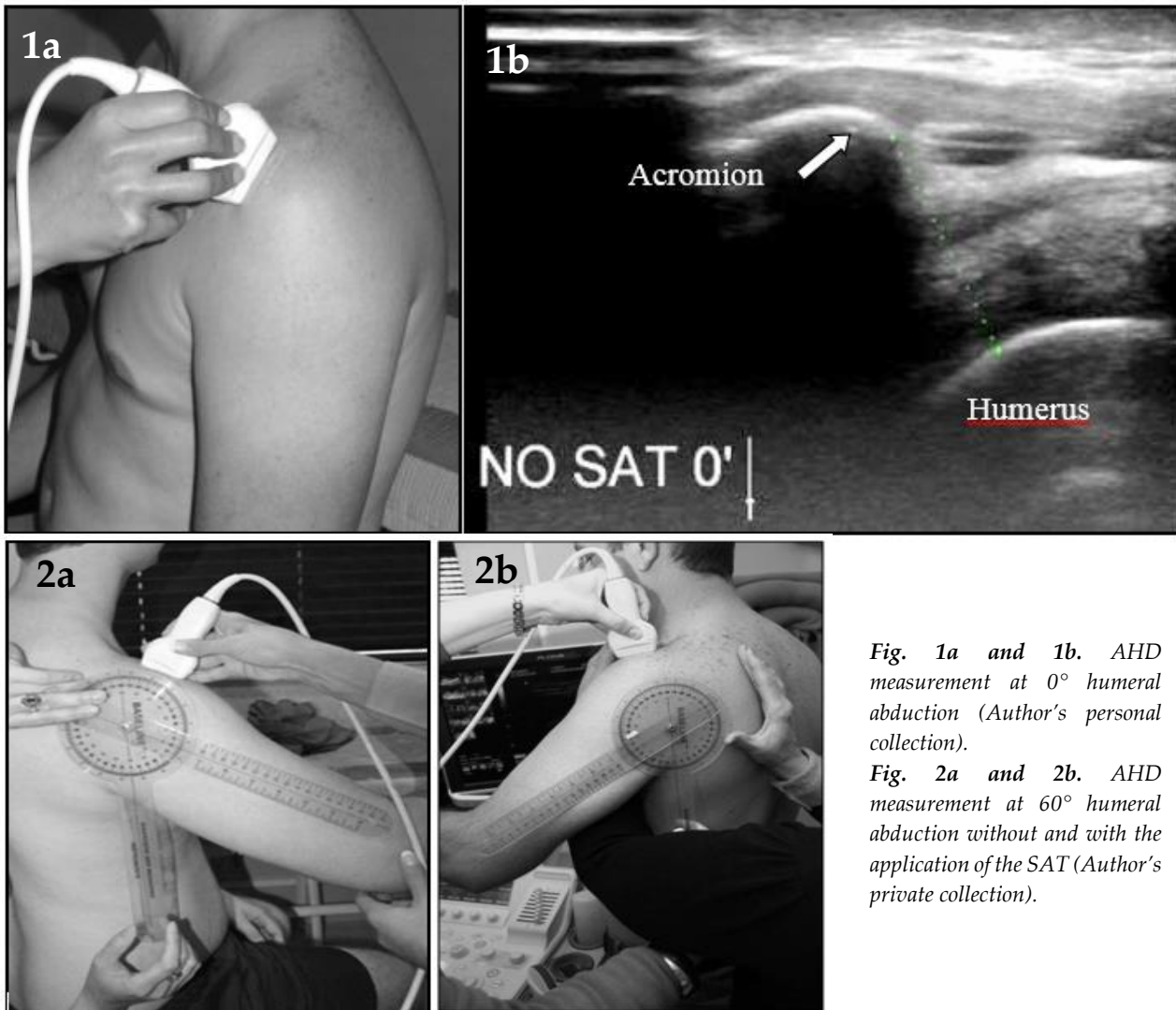
Fig. 1a and 1b. AHD measurement at 0° humeral abduction (Author's personal collection).