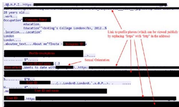
Figure 2. An example of unencrypted sensitive information being sent from Bumble app.

The cookies leaked from Bumble , an online dating application used by approximately 800,000 users as of August 2015 [31], contained private information and online dating history. We observed not only the profile information of the individual connecting to our experimental public Wi-Fi network, but also 29 other profiles that the individual had viewed. These profiles included information such as name, date of birth, photo, education, and sexual orientation, and, in some cases, an Instagram username which allows us to find out more information about him/her. We also noted that even though the URL links to profiles photo were configured as “https”, we could replace it with “http” in a web browser and view these photos without having to sign up or install Bumble application. An example of the cookie from Bumble is in Figure 2 with sensitive information redacted.