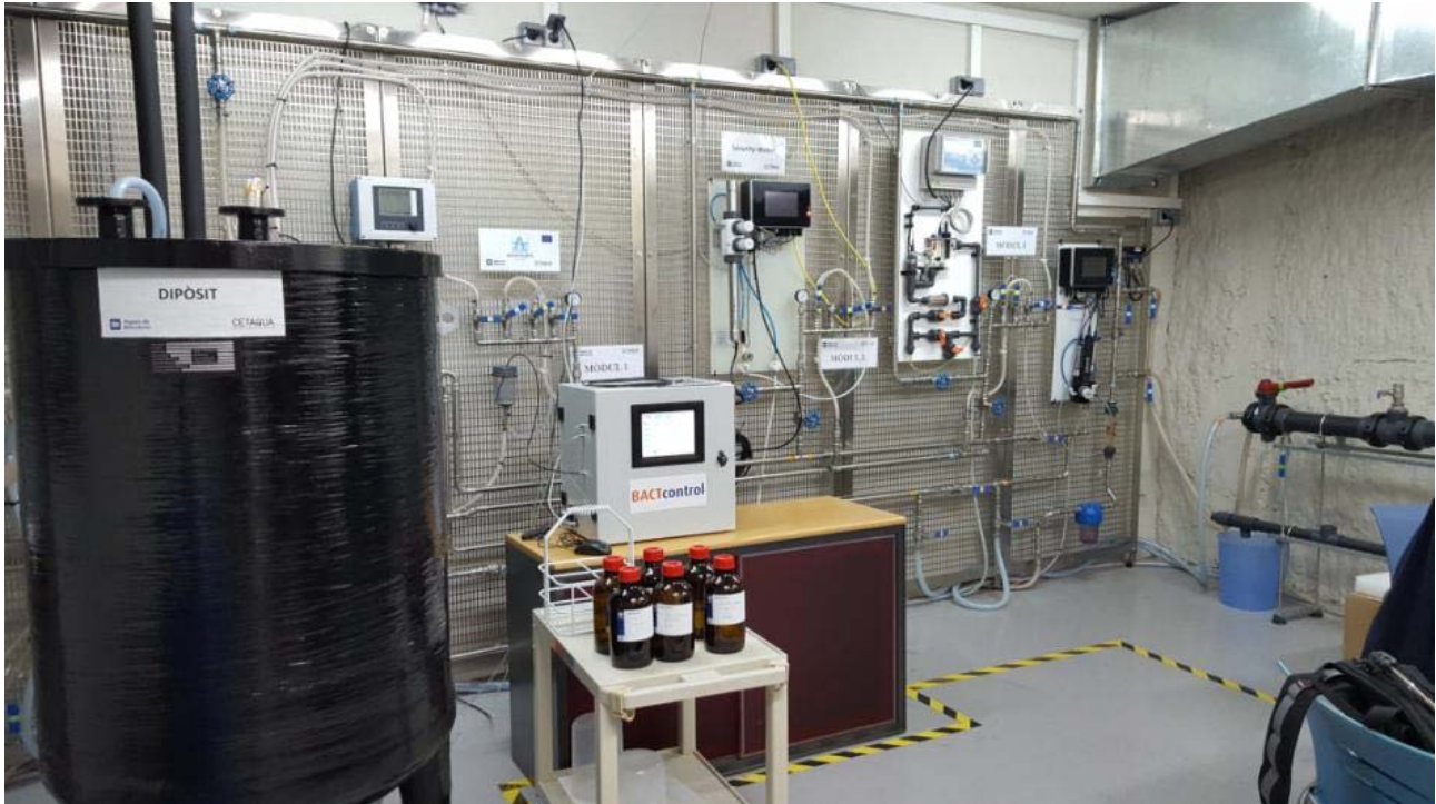
Figure 3. The BACTcontrol installed in a test rig at Aigües de Barcelona, the water supply for Barcelona, Spain.

The investigation involved changes in the water source e.g. shifting from surface water to groundwater. Also the effect of reactivation of catchment pumps could be detected in some cases, which may be explained by mobilization of stagnant water in the treatment train.