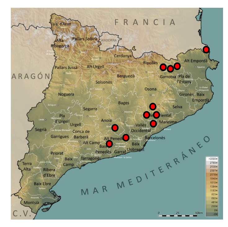
Image 1. Location of EICs where we conducted interviews. The image shows the approximate geographic distribution in Catalonia of the Environmental Intentional Communities used for data collection through interviews. Each red circle symbolizes a community.

In order to understand more fully the motivations that led people to be part of an eco-community in Catalonia, we analysed testimonies from 29 informants in 11 different eco-communities. The data collection is detailed below. Image 1 shows the communities distribution used for data collection.