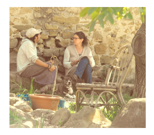
Image 2. The fieldwork. This photo was taken during one of the semi-structured interviews at one of the Ecological Intentional Communities in north Catalonia.

The 29 testimonies were recorded then transcribed and analysed with RQDA (Huang 2009), open-source software for qualitative data analysis. As a result, a coded list of items was produced, in line with our research interests. Field notes were also coded to complement the interview data.