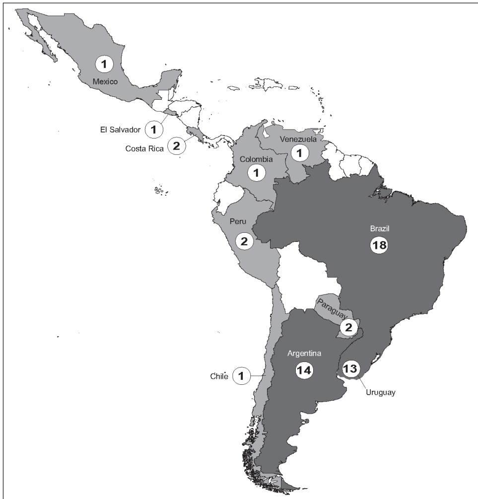
Figure 2. Map of Latin America indicating the countries where freshwater invertebrate and vertebrate hosts, of four classes, have been studied for neotropical symbiotic temnocephalans. Countries with major to 10 species records in dark grey and minor to 2 in light grey. The numbers in circles indicate the total temnocephalan taxa recorded. Map produced by http://www.naturalearthdata.com/ , and modified in DIVA-GIS 7.5 (Hijmans et al. 2012) (freely available through www.diva-gis.org ).

species (e.g. Ahyong and Yeo 2007, Larson and Olden 2012). To date, the values of ecological infection parameters (e.g. prevalence and abundance; see Bush et al. 1997) are unknown not only locally but globally. These parameters are required to measure the effect of this symbiotic association – both introduced species, C. quadricarinatus and D. boschmai – to detect the extent of the spread of D. boschmai to other crustacean taxa, especially endemic crabs in their natural ecosystems (Jones and Lester 1993, Chivavaya 2013, du Preez and Smit 2013). Furthermore, the introduced populations of D. boschmai in natural hydrological systems in Uruguay represent a serious problem of displacement to the endemic populations of Neotropical Temnocephala species because of interspecific competition between symbiotic organisms (Gelder 1999, Sicard et al. 2006, Witte et al. 2008, Tsuchida et al. 2011, Ohtaka et al. 2012). In this context, the data generated in this checklist can be used to support conservation strategies for freshwater biodiversity (Cardoso et al. 2011a, b, Stendera et al. 2012, Collen et al. 2013).