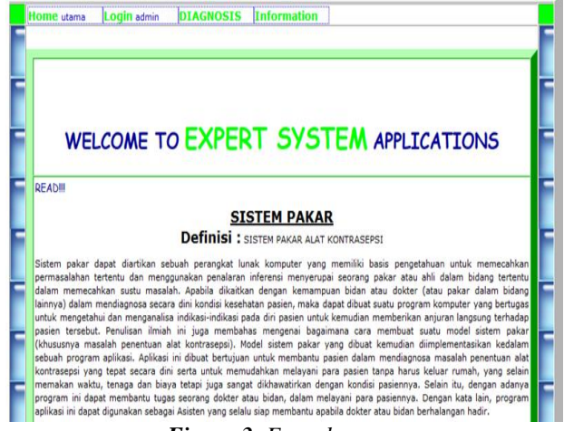
Figure 3. Form home