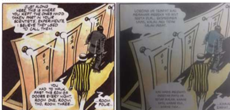
Figure 02. shift in target text caused by context of visual structure: representational process narrative, circumstance

Representational metafunction is foreground metafunction. This metafunction deals with issue of representation how the image depicting real-world object. There are two components in representational metafunction. First one is symbolization, this component represents how images symbolize the real-world object and the second component called the narrative component, this component represents how images illustrate flowing story if the viewer analyzing the performance and the foreground and background of the images. The performance is the process (similar to systemic functional term) and the foreground and background are the circumstance. Below is the example of the shift in and target text caused by context of visual structure: representational process narrative, circumstance: