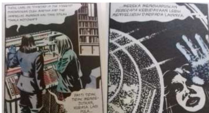
Figure. 02. Target Text of Panel 3, line 3, page 18 and first panel, first line from page 19 V for Vendetta