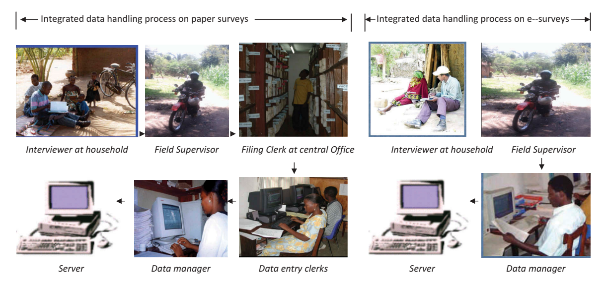
Figure 1. Integrated data collection and management cycle of household surveys in Rufiji Household and Demographic Surveillance e-Surveys, electronic surveys.

At each stage of the data-handling process, for both survey methods, the data are subject to quality checks until the data are thought to be sufficiently clean for archiving and analysis [13,22]. Figure 1 shows an integrated data collection and handling cycle of the RHDSS. The Rufiji HDSS team comprises