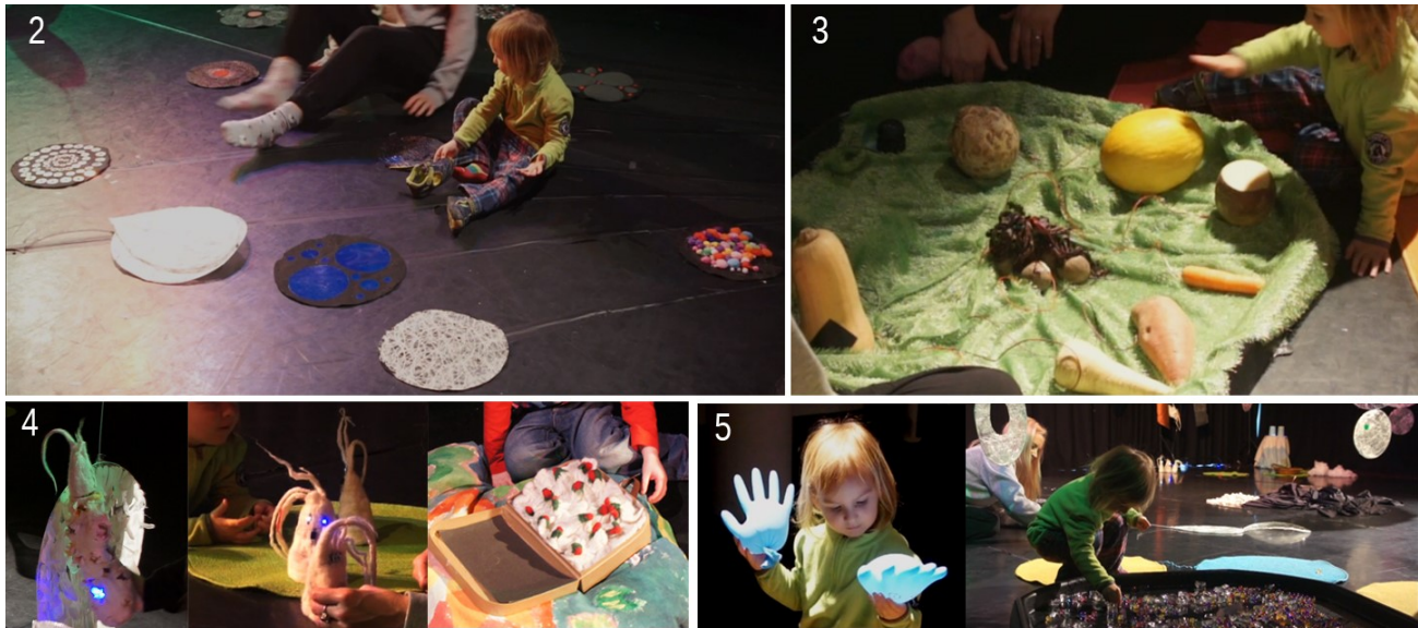
Figure 2. Prototypes: 2 Tactile Mats, 3 Musical Fruits & Vegetable, 4 Felt Creatures, 5 Malleable objects: gel beads and gloves

Combination: Further exploration of the Connection and Positioning play patterns was afforded by magnets around the circle, which enabled connect, detach and reposition. Some discs had small holes cut out on the surface areas to afford connections through playful interaction and peekaboo games. Others had tactile material added to the surface such as feathers, fabric and small strips of plastic to afford more tangible interactions.