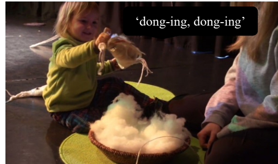
Figure 5. 'Dong-ing, dong-in' making the puppet jumping up and down on the carded wool in the basket

crisps for himself and his mum and dad. Once he gets the pretend crisp packet, he runs over to his mum, first he takes the crisp packet and the second time he explains, how he used a credit card. Then he and his puppet join the shopkeeper at the back of the shop (Figure 5) and he makes the puppet jump up and down on the wool saying 'dong-ing, dong-ing' with a smile.