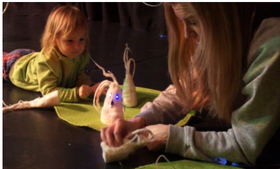
Figure 4. The LED light transforms the inanimate felt object into a 'live' hand puppet.

Fantasy and sociodramatic play are common with children at this age. Our pre-show survey found that 17 out of 19 children engaged in role play such as being, a hairdresser, shopkeeper, doctor, etc. In the performance the felted hand puppets became the catalyst for sociodramatic and symbolic play (Figure 4). The following extract was the longest pretend play (14 minutes) episode during the study.