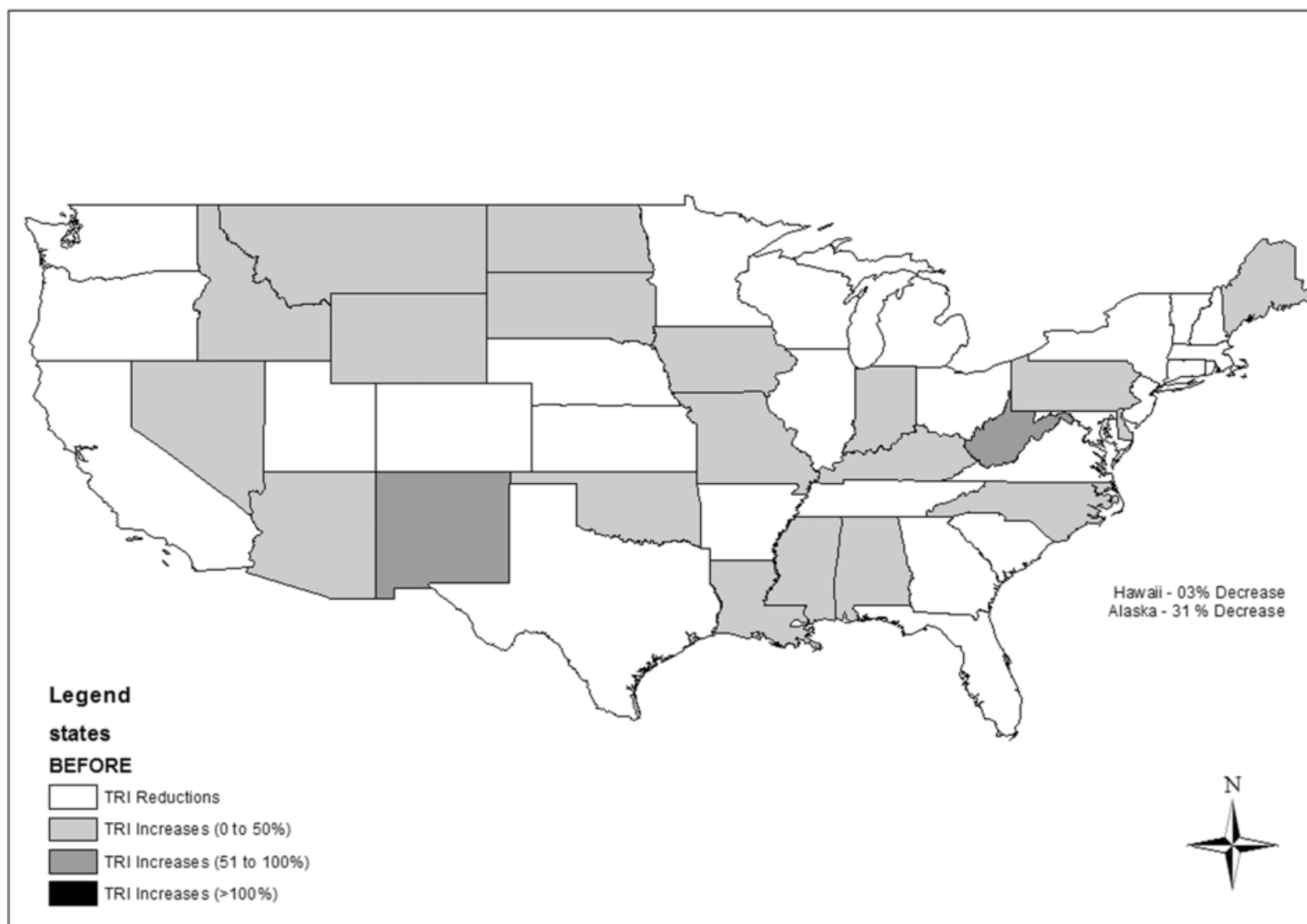
Fig. 1. Change (%) in toxic releases by state before the recession, 2005–2007