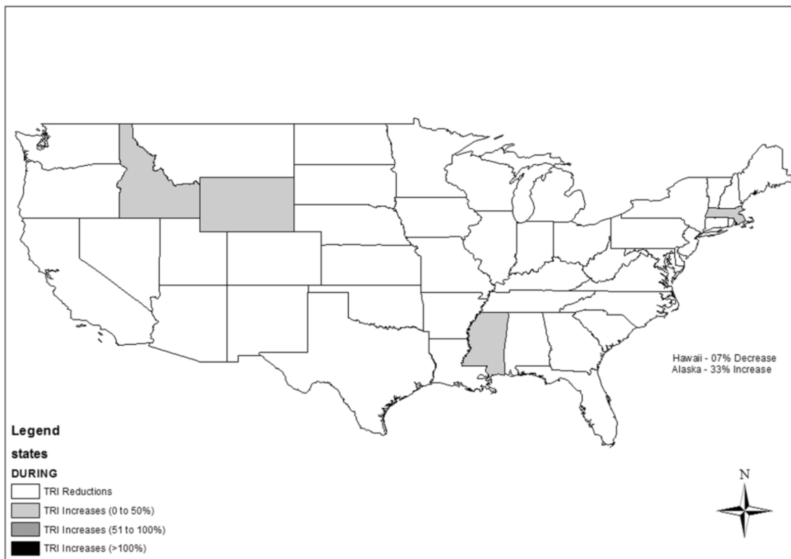
Fig. 2. Change (%) in toxic releases by state during the recession, 2008–2009.