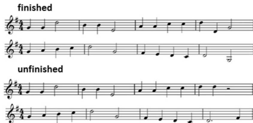
Fig. 1. Examples of stimuli used in the music experimental battery: 'finished' (tonally resolved) and 'unfinished' (tonally unresolved) melodies presented in the tonal (harmonic) expectancy test (see text for further details).

Abbreviated Scale of Intelligence (WASI) Matrices score, an index of overall disease severity] within the patient cohort.